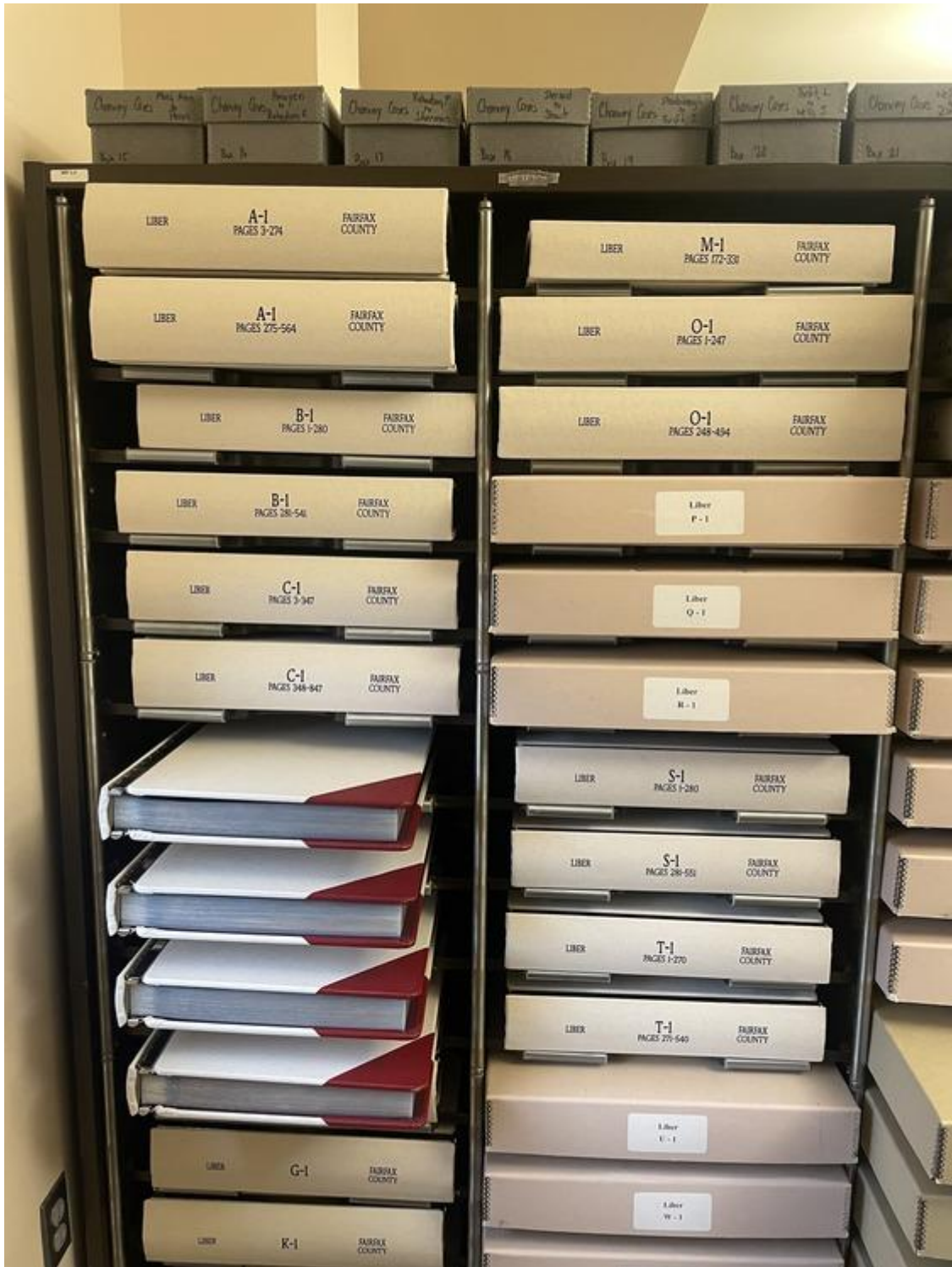
Fairfax County Deed Books