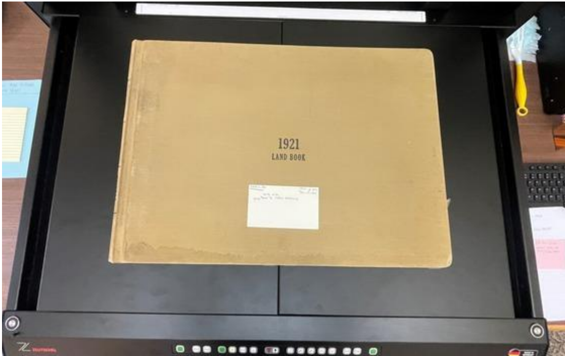
Fairfax County 1921 Land Tax Book, index card for size reference

Upon installation of the scanner, Historic Records Center staff were provided with training, and we are excited to get to work using our new scanner so we can better serve researchers and make more of our records available digitally!