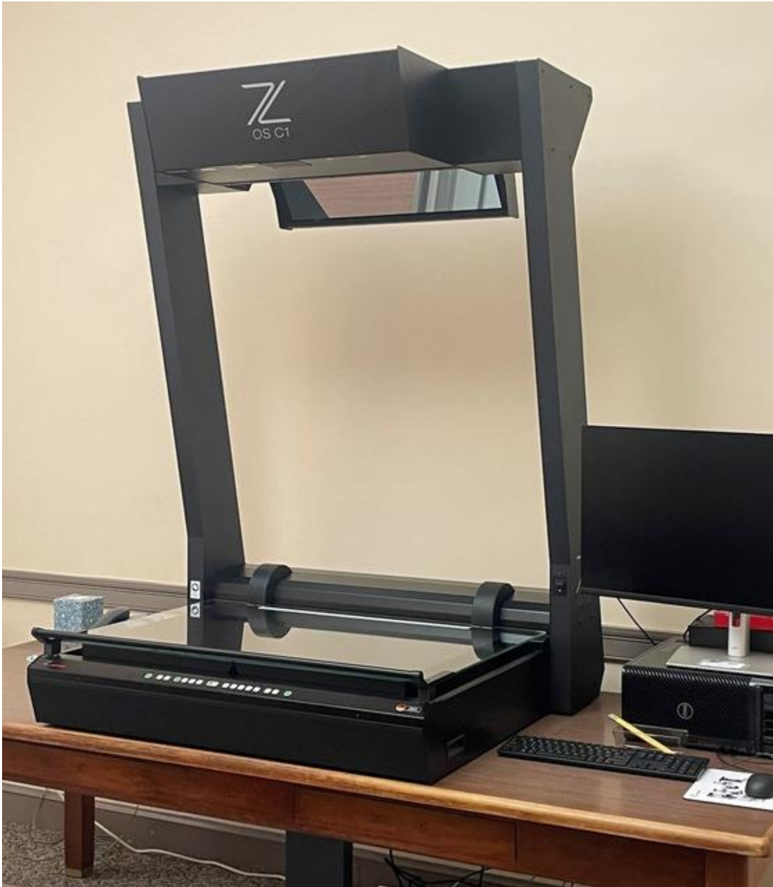
Zeutschel OS C 1 Scanner