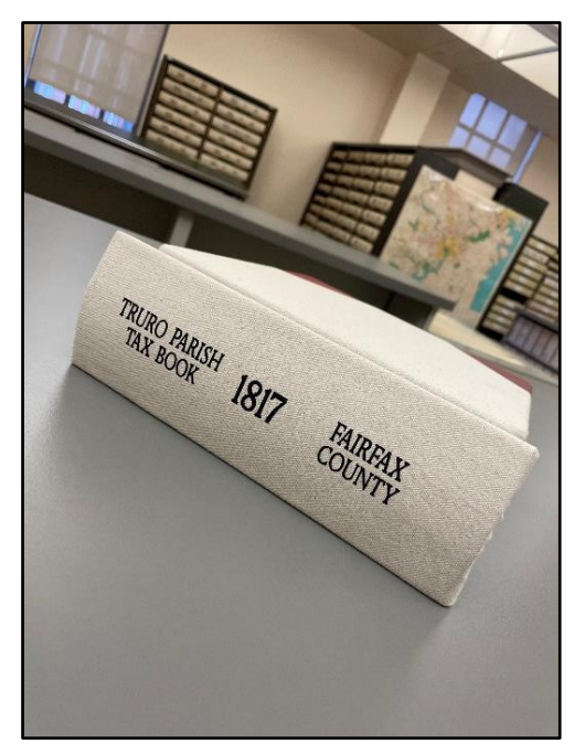
Fairfax County Truro Parish Tax Book, 1817

Perhaps the most interesting of these recently conserved items is the 1817 Truro Parish Tax Book. This tax book is significant because it is the county's oldest surviving tax book, and it provides researchers with valuable information on life in Fairfax County in the early nineteenth century. This book contains a record of all the taxes owed and paid by residents of the Truro Parish area in Fairfax County and is a record of property on which citizens were taxed, including enslaved persons, horses, and land. This book had some specific problem areas that needed to be addressed by the conservators, including repairing torn and brittle pages, chemically treating the acidic ink and paper that was used during the nineteenth century, encapsulating the pages in Mylar sleeves, and rebinding the pages so the book can be used by researchers and archivists without fear of creating further damage.