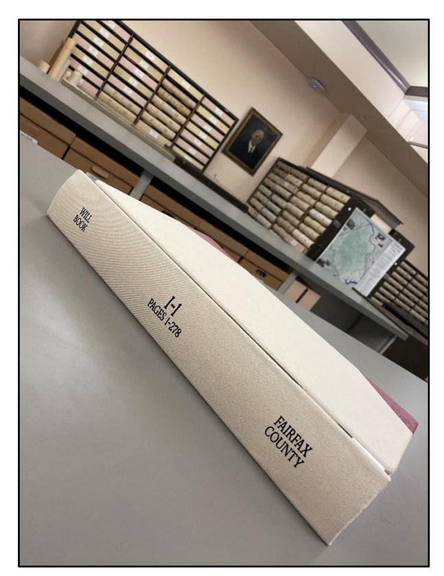
Fairfax County Will Book I-1 page 41