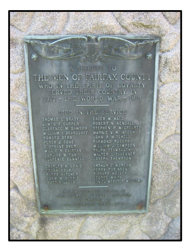
Photo of World War I side of the Fairfax County War Memorial marker standing in front of historic Fairfax Courthouse.

Finally, the third set of names lists those men who belong to the Students Army Training Corps (S. A. T. C.). This organization was operated by the United States War Department and trained male college students for military service, while ensuring they would remain enrolled in their college courses.