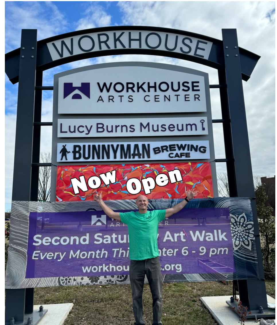
Bunnyman Brewing Cafe's owner celebrates the opening of its second location in Lorton.

The new restaurant and brewery offers a blend of craft brews, food, and welcoming atmosphere on the historic campus. Bunnyman Brewing Cafe provides a gathering place for visitors and residents, while contributing to the programming and activation goals of the Workhouse Arts Campus and the development of the surrounding community in Lorton.