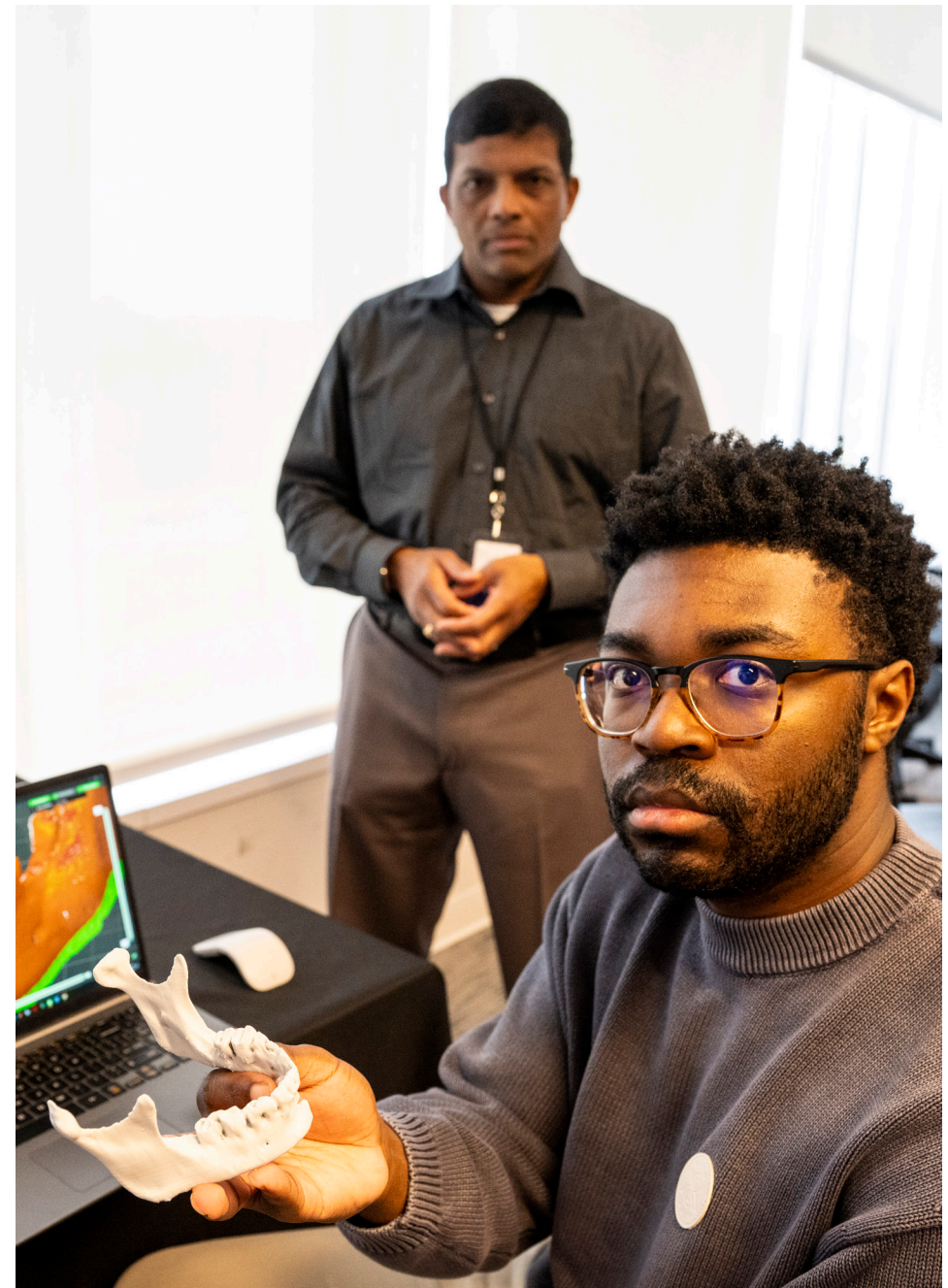
Fairfax Founders Fund has awarded 13 innovation grants to-date, including 3DOS (above) who develops innovative 3D-printed medical devices and dental implants.

Fairfax Founders awardees achieved significant milestones, including a Google partnership, successful clinical trials, and an Air Force contract. The Fund empowers startups, aligning with DEI's strategy to foster innovation and economic prosperity in Fairfax County.