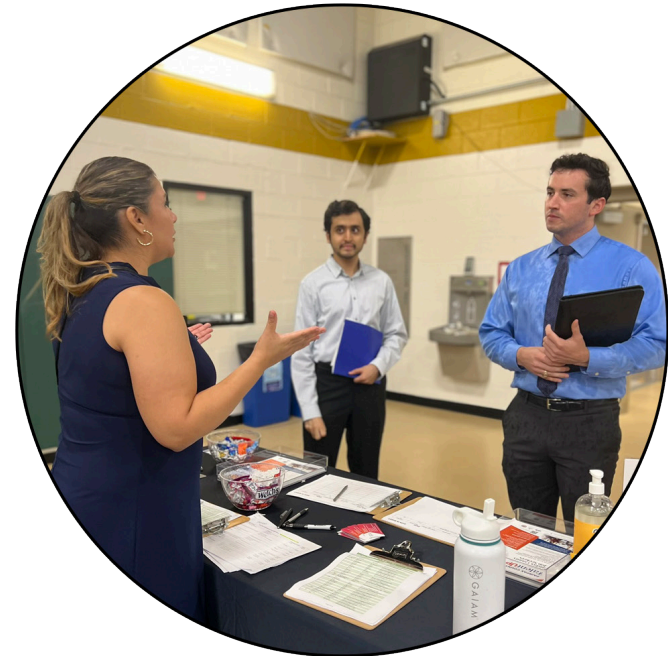
The Talent Up Job Fair at Northern Virginia Community College attracted 500+ jobseekers.