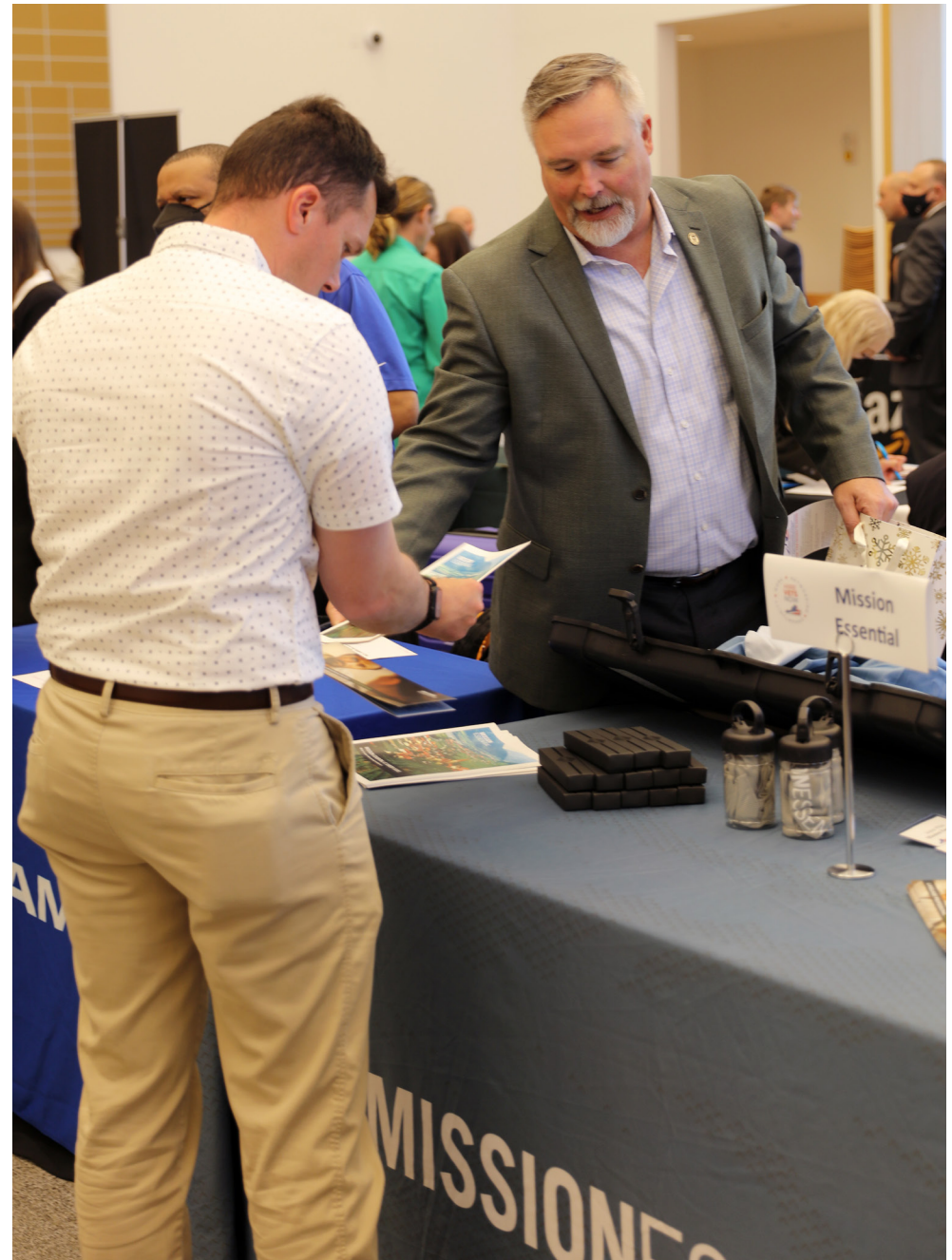
More than 300 job seekers connected with more than 75 employers at the three job fairs at Fort Belvoir.

The Fort Belvoir History Working Group was also formed in 2024, as a cooperative dedicated to preserving and promoting the installation's rich history. As we look ahead, we remain committed to exploring new avenues for collaboration and leveraging the unique opportunities presented by this partnership.