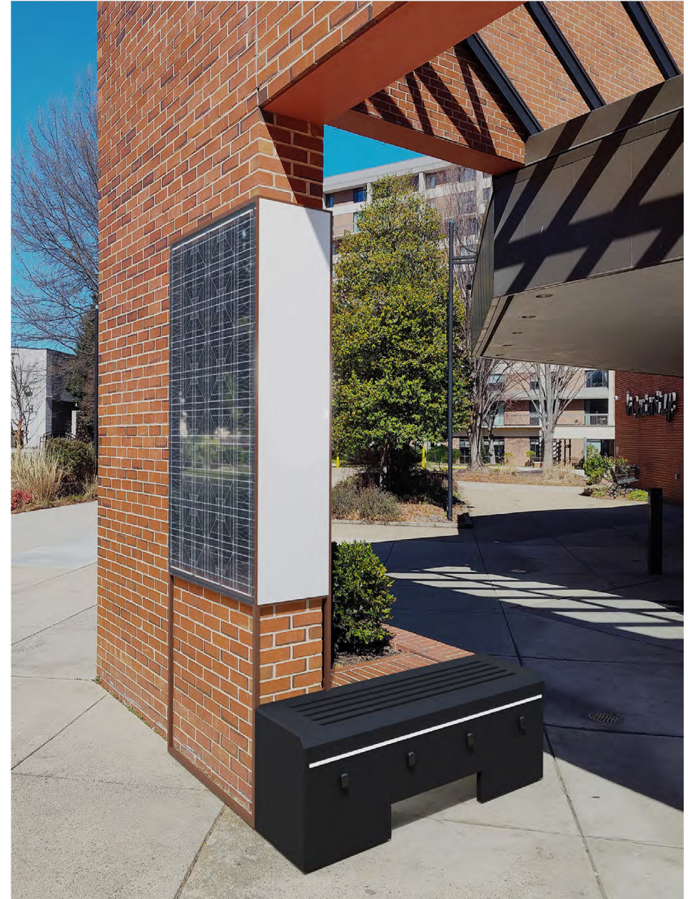
Asoleyo's solar panels, which are both useful and attractive, will be installed in Reston in 2025.

Asoleyo received approval from the Reston Association's Design Review Board this summer, showcasing that solar energy integration can be both beautiful and beneficial. Final regulatory reviews should be complete soon; with the installation expected in 2025. This demonstration project highlights how solar energy can cohesively fit into existing structures and paves the way for additional projects.