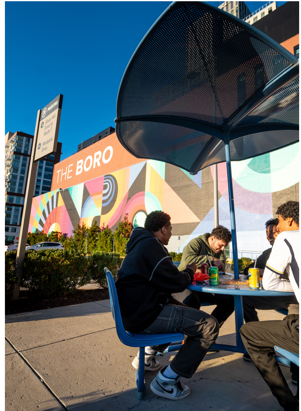
The Boro is the largest dining and entertainment mixed-use project in Tysons.