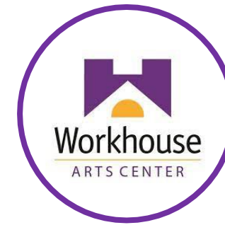
Workhouse Arts Center