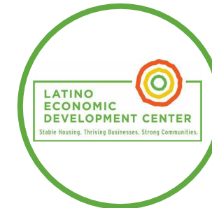
Latino Economic Development Center