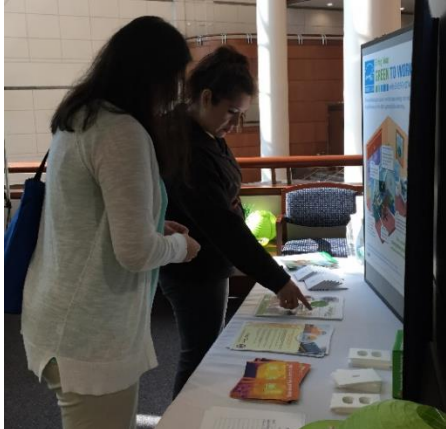
FEEE's 2018 Green Lounge

Fairfax Employees for Environmental Excellence (FEEE) serves as Fairfax County's employee green team. FEEE strives to foster a greener workplace culture by encouraging employees to participate in existing environmental programs, including recycling, green purchasing, and the reuse of surplus county property, and to identify new opportunities for minimizing the county's environmental impact. This focus area supports the efforts of county departments and agencies, either in conjunction with FEEE or on their own, to inspire and empower employees to exercise environmental responsibility, particularly in the areas of waste management and recycling, energy efficiency and conservation, and emissions reductions.