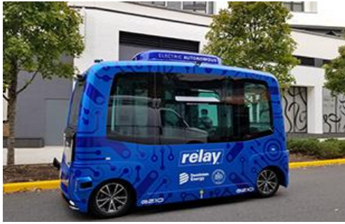
Merrifield Electric Autonomous Shuttle

This focus area supports the transition from gasoline-powered vehicles to hybrid-electric and electric vehicles (EVs). The transition with respect to passenger vehicles has been underway for several years in response to the county's interest in cleaner and more energy-efficient vehicles. In May 2021, Fairfax County was awarded state grants to fund several additional types of EVs and their charging stations, including four electric shuttle buses, four electric solid waste and recycling trucks, and an electric box truck.