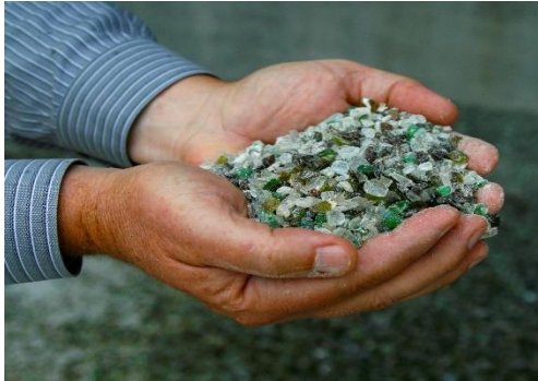
Crushed glass for reuse or sale

Fairfax County is environmentally responsible both in the waste disposal and recycling options it offers to residents and in its own waste management operations. For example, its circular economy glass recycling initiative, started in 2019 and expanded regionally, led to the collection and reuse of over 4 million pounds of glass just by 2020. Achieving the Zero Waste target by 2030 will require concerted efforts across county operations, including additional circular economy initiatives and reimagined procurement, recycling and disposal practices.