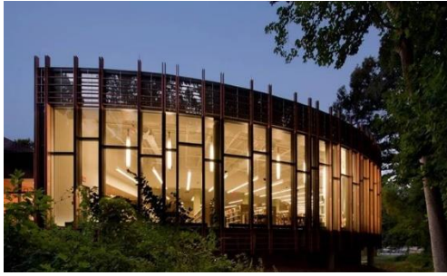
Dolley Madison Library (LEED® Gold)

The construction of net zero energy (NZE) and near-NZE buildings and major renovations is a critical component of Fairfax County's plan to achieve energy carbon neutrality. Minimizing energy use through efficient building design is a fundamental design criterion. In addition, as the electric grid in Virginia continues to decarbonize, ensuring that new construction and major renovations avoid direct use of fossil fuels allows the county to further reduce carbon emissions while maximizing use of on-site renewable electricity from solar photovoltaics.