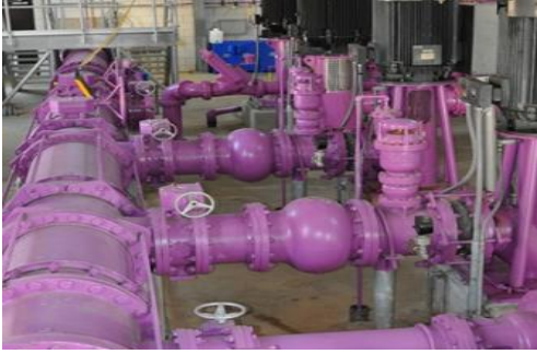
Fairfax County Water Reuse Facilities

Measures that reduce water use in county operations achieve energy savings and environmental benefits. Direct benefits include reductions in the county's water and sewer costs and the conservation of valuable treated drinking water. Indirect benefits include reductions in county government electricity use and the avoidance of associated GHG emissions, because water treatment and distribution are energy intensive activities.