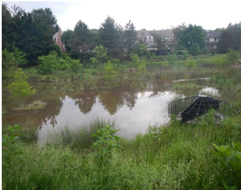
Wetland-enhanced stormwater pond retrofit

The stormwater management program is administered through several county agencies and has two facets – regulatory and operational. The regulatory program focuses on new and redevelopment land development activities and is instrumental in the adoption and implementation of standards through the Public Facilities Manual and the Stormwater Management Ordinance (Chapter 124) adopted in 2014. The operational program focuses on: 1) the maintenance of the stormwater infrastructure; 2) retrofitting of existing development (by implementing stormwater management practices and techniques to address both the quantity and quality of water entering local streams); and 3) the