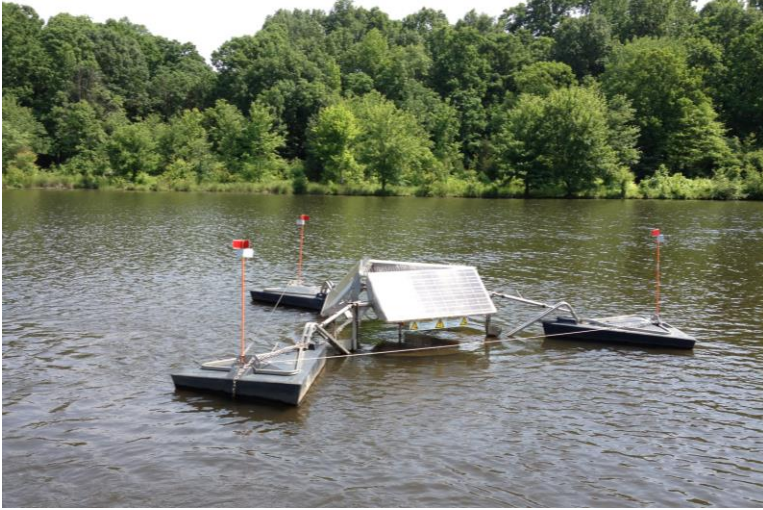
Solar powered water circulator

In Fairfax County the drinking water system is operated by Fairfax Water, a water utility governed by a board of ten members who are appointed by the Board of Supervisors of Fairfax County. Fairfax Water withdraws raw water from the Potomac River and the Occoquan Reservoir. The water is then treated at either the James J. Corbalis Jr. Treatment Plant or the Frederick P. Griffith Jr. Treatment Plant, respectively. The treated water is then distributed through an underground pipe network to