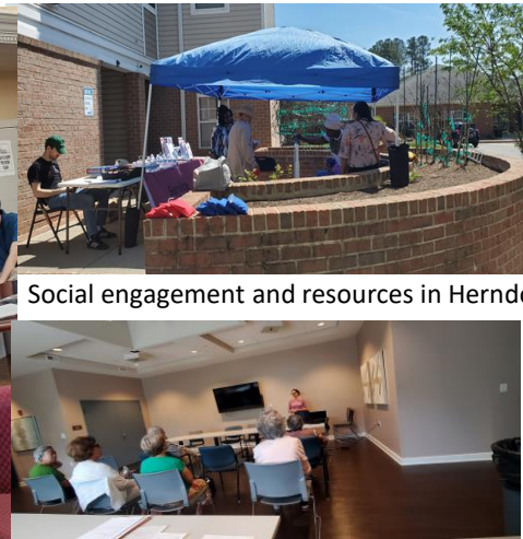
Presentation on Dementia in McLean