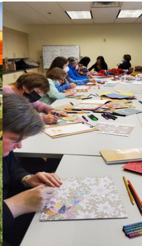
Arts and crafts in Alexandria