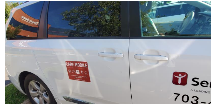
CARE Mobile van