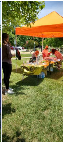
Wellness event in Fairfax