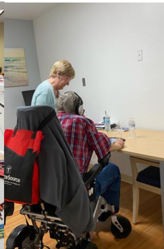
Hearing screening in Fairfax