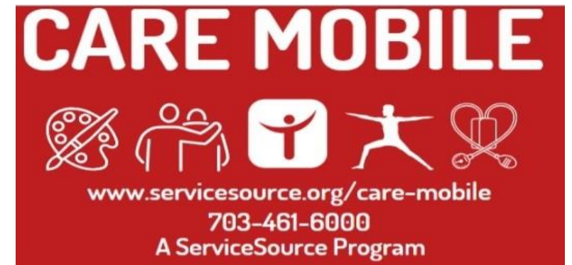
CARE Mobile Logo