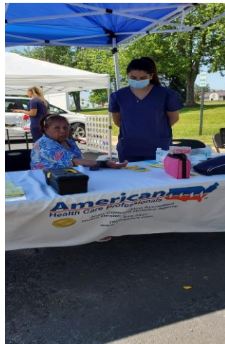
Blood pressure screening in Chantilly & Falls Church