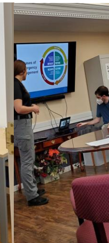
Emergency preparedness presentation