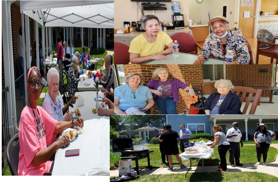
Memorial Day cookout in Alexandria