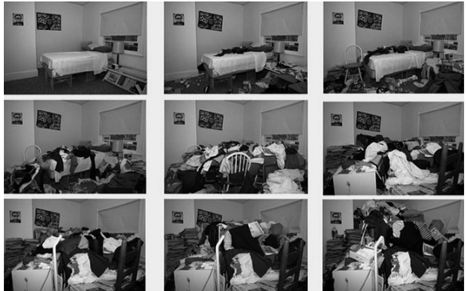
Example from the International OCD Foundation Hoarding Centre. Clutter image rating for a bedroom—levels 1-9. Levels are progressive with 1 as the lowest.