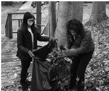
There are never too many leaves for volunteers who rake yards for seniors.