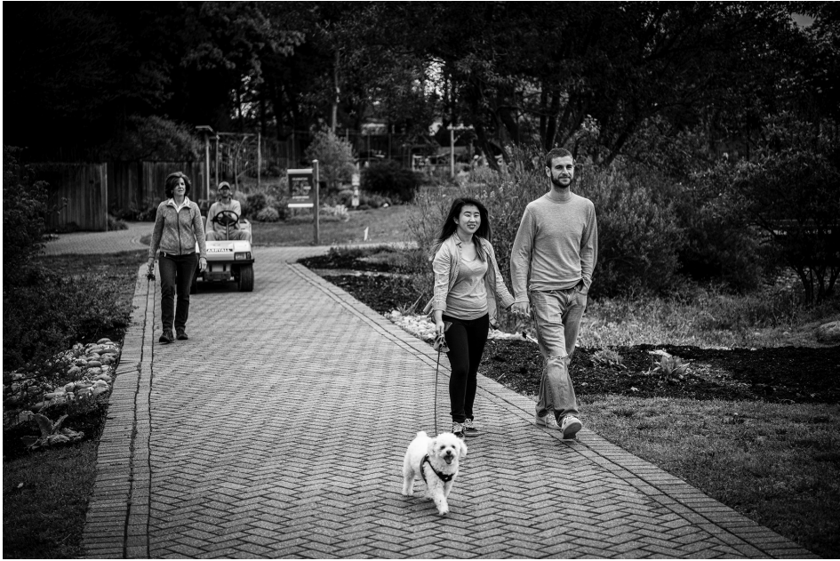
Fairfax County residents enjoy strolling the grounds of Green Spring Gardens. Located in Alexandria, the park grounds are open daily from dawn to dusk.

Fairfax County's 420 parks, nine fishing lakes, and 330 miles of trails are open every day! In addition to their natural beauty and availability throughout the county, parks are open to everyone at no cost.