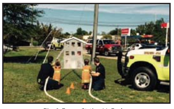
Fire & Rescue Station 14, Burke