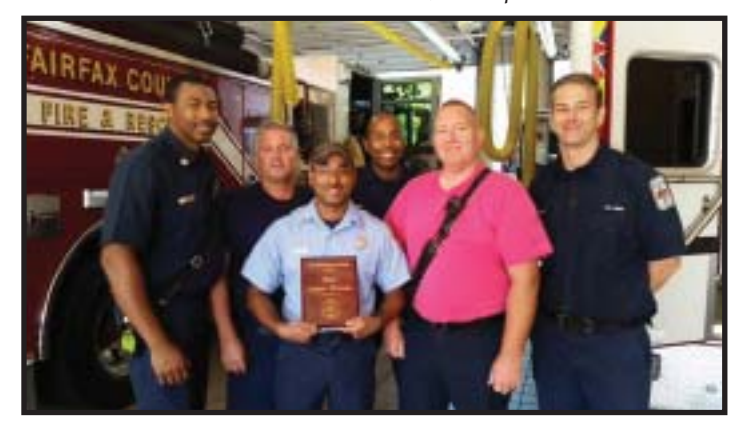
Fire & Rescue Station 11, Penn Daw