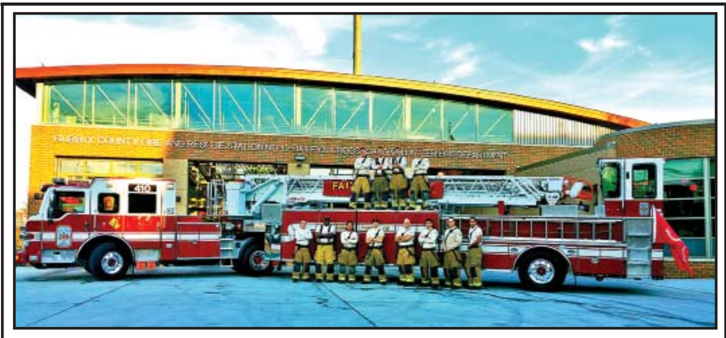
Firefighters from Fire and Rescue Station 10, Bailey's Crossroads, pose wearing their Veterans Day tee shirts honoring all veterans who have served past and present, November 11, 2015.