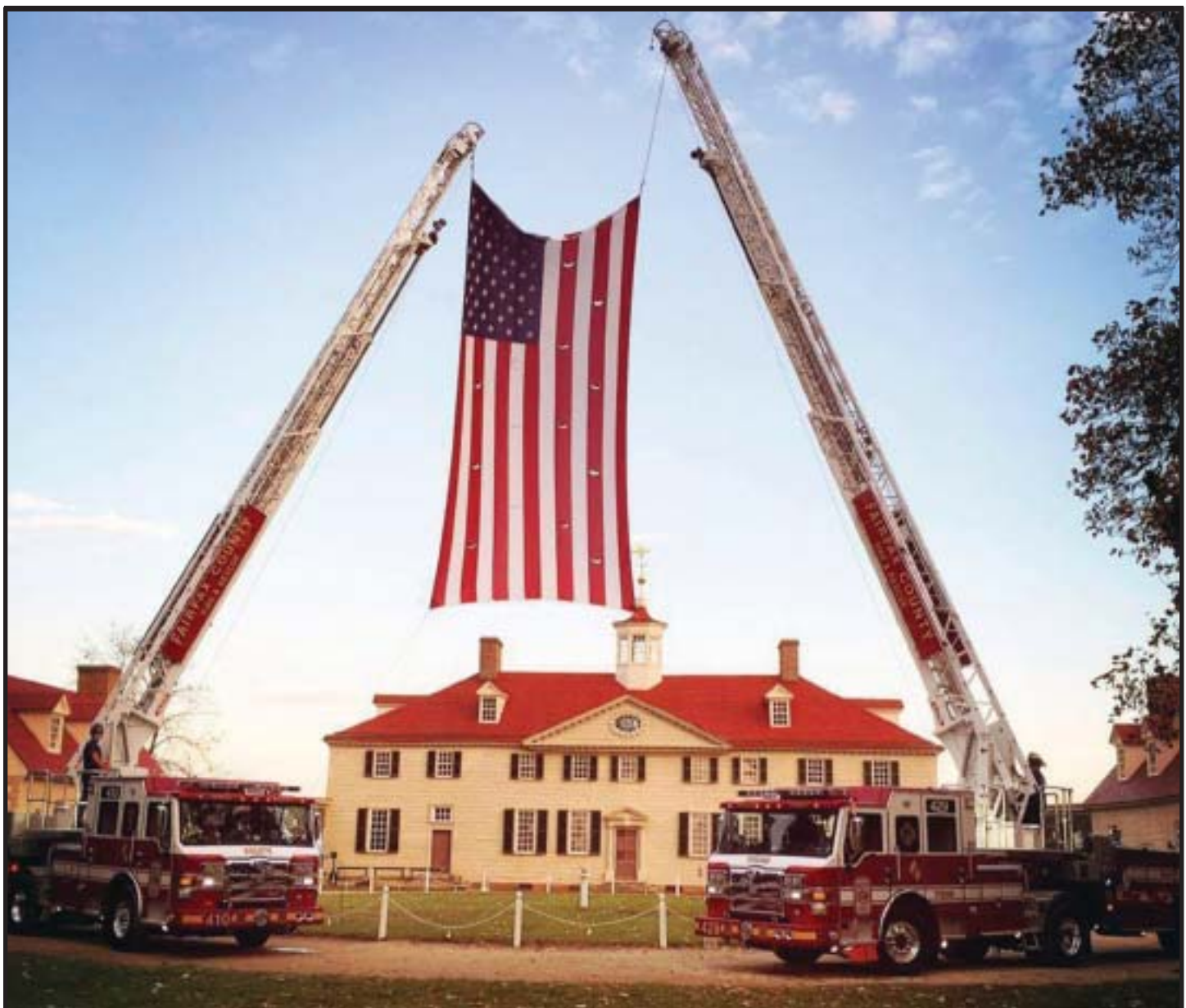
Tiller trucks from Fire Station 10, Baileys Crossroads and Fire Station 29, Tysons Corner, hoist the American flag at the Mount Vernon Estate on Veteran's Day.

decision making, emergency care and community outreach efforts must match the response environment. Just think if we had not made changes to these items over time and implemented SIOC. I am proud of everyone that had a part in saving these lives.