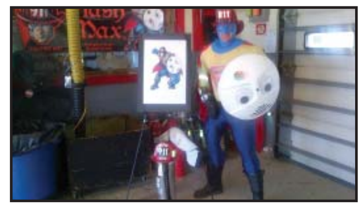
Fire & Rescue Station 11, Penn Daw