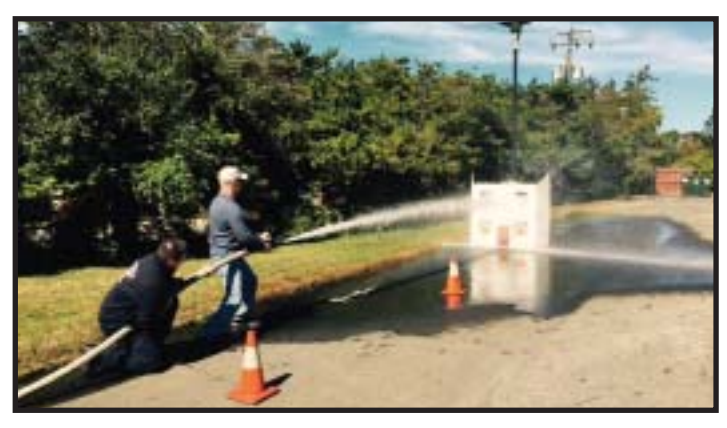
Fire & Rescue Station 23, West Annandale