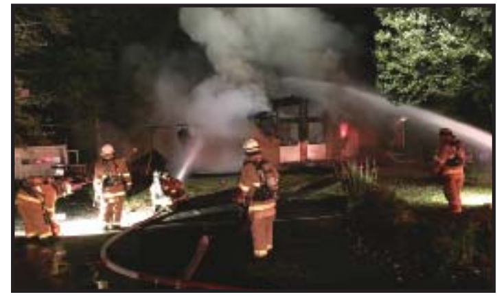
Firefighters responded to a fully involved house fire, September 29, 2015, at 12538 White Drive. The home was vacant and a total loss. The cause of the fire is under investigation.