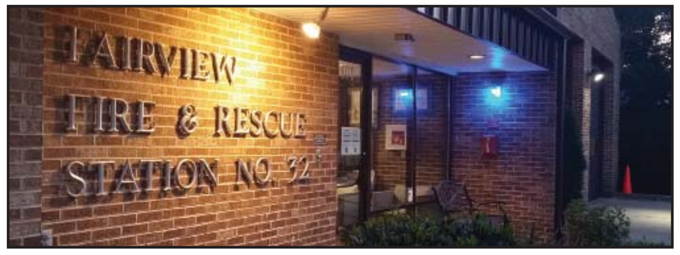
Fire and Rescue Station 32, Fairview, uses a "blue light" at the firehouse entrance to show solidarity and silent support with the Fairfax County Police Department.

Ultimately, I would love to see this show of solidarity spread throughout all of the Fire Departments within Northern Virginia. We need to continue to demonstrate to our LEOs that we support them! ❖