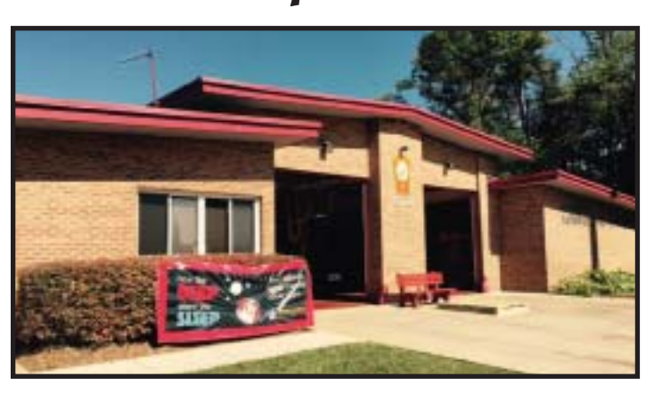
Fire & Rescue Station 23, West Annandale