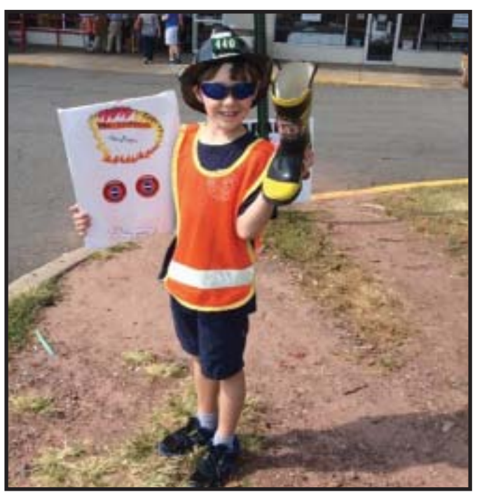
Fairfax County Fire and Rescue Department again collected the most money among fire department in the nation. The amount collected was $615,945 and broke the previous record for collections. A mighty thanks to all those who participated in the five-day event.