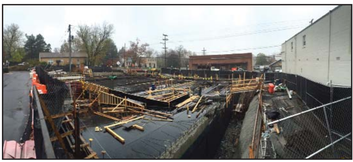
"The Fairfax Way, Moving Forward."