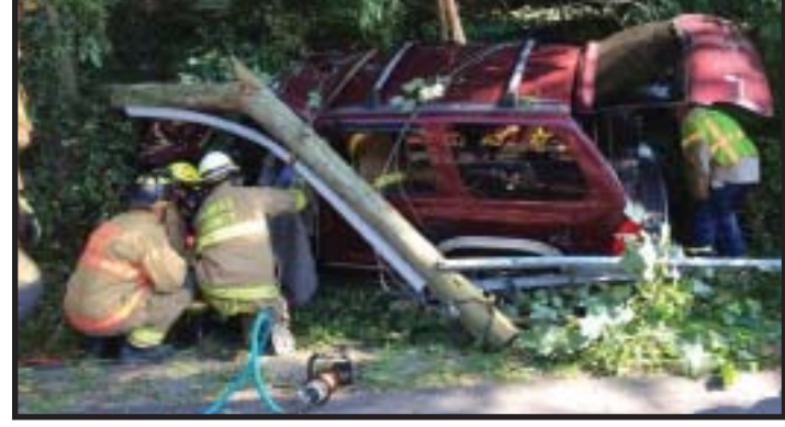
Firefighters respond to a vehicle crash into a light pole on Burke Center Parkway, August 14, 2015. Crews extricated the adult male and he was transported to Inova Hospital with life-threatening injuries.