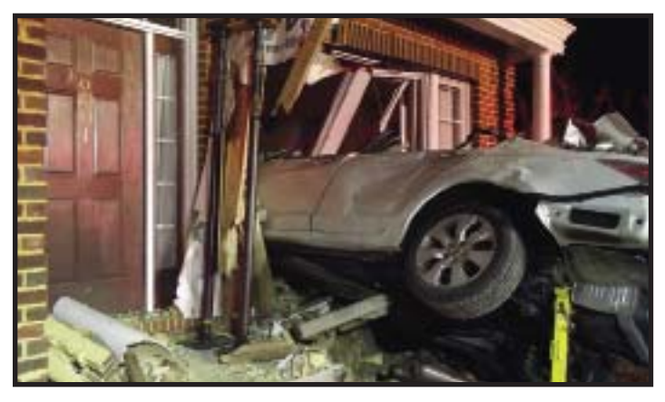
Crews responded to a car into a house October 27, 2015, at 6801 Smithway Drive, in the Alexandria area of Fairfax County. Firefighters extricated the occupants; however, the passenger was deceased at the scene, and the driver was transported to Inova Mount Vernon Hospital where he was pronounced dead. No one was home at the time of the crash.