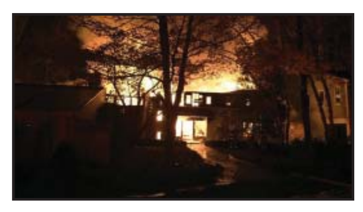
Firefighters battle a fully involved house fire on November 16, 2015 in the Great Falls area. A tanker task force and other specialty units responded to the large ranch-style home. The home was a complete loss.