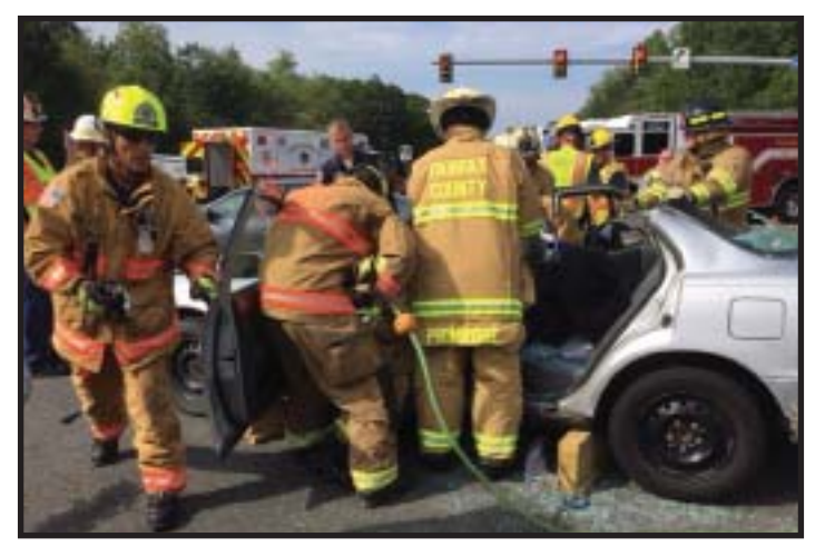
Units from the seventh battalion extricate an adult woman from a two vehicle crash, August 30, 2015; she was then flown to Inova Fairfax Hospital. Firefighters also transported two other patients by ground.