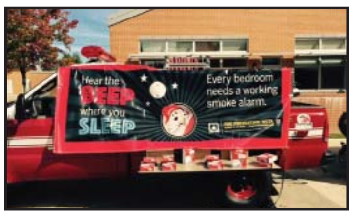
Fire & Rescue Station 41, Crosspointe