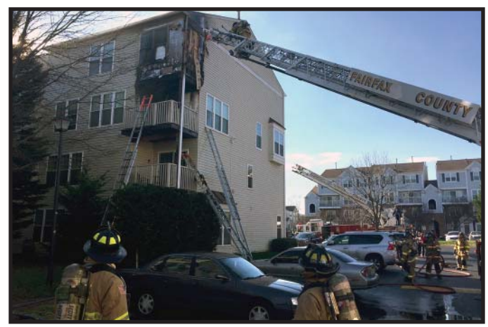
Units responded to an apartment fire in the Franconia area on December 16, 2016.