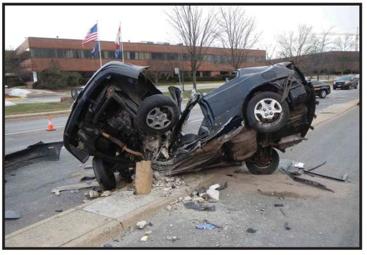
Units responded to a vehicle that crashed into a light pole in the Herndon area. There was one victim trapped in the vehicle. It took approximately 50 minutes for crews to extricate the victim. The patient was transported to Inova Fairfax Hospital.