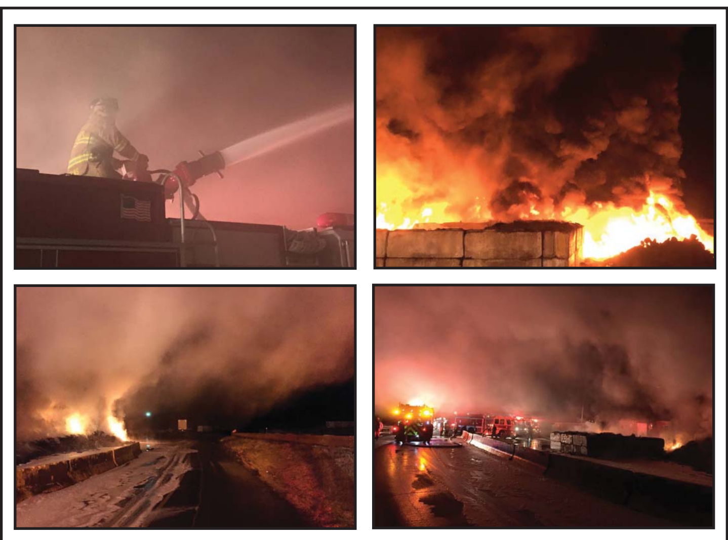
Units responded to the Fairfax County Landfill in Lorton, February 6, 2016, for an outside tire fire in the recycling section of the landfill. Units worked through the night to contain and extinguish the fire. Damages were estimated at $600,000.