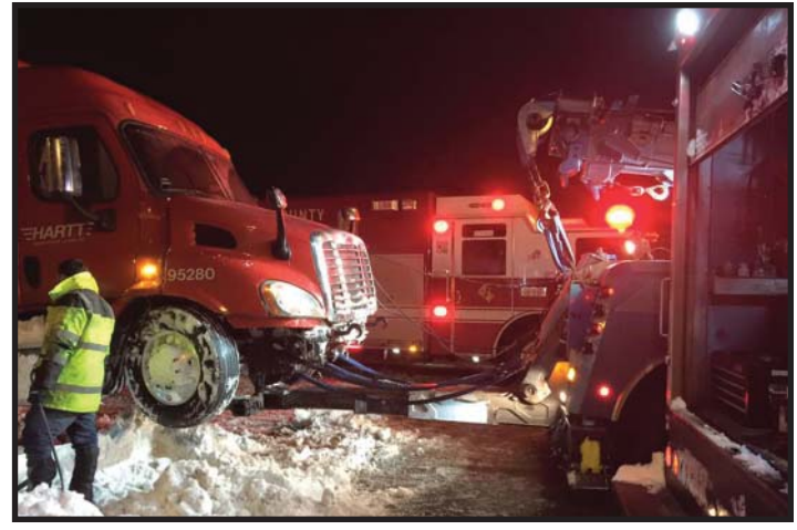
On January 25, 2016, during the January Snow Storm, Units responded to numerous vehicle accidents including this tractor trailer accident on Interstate.