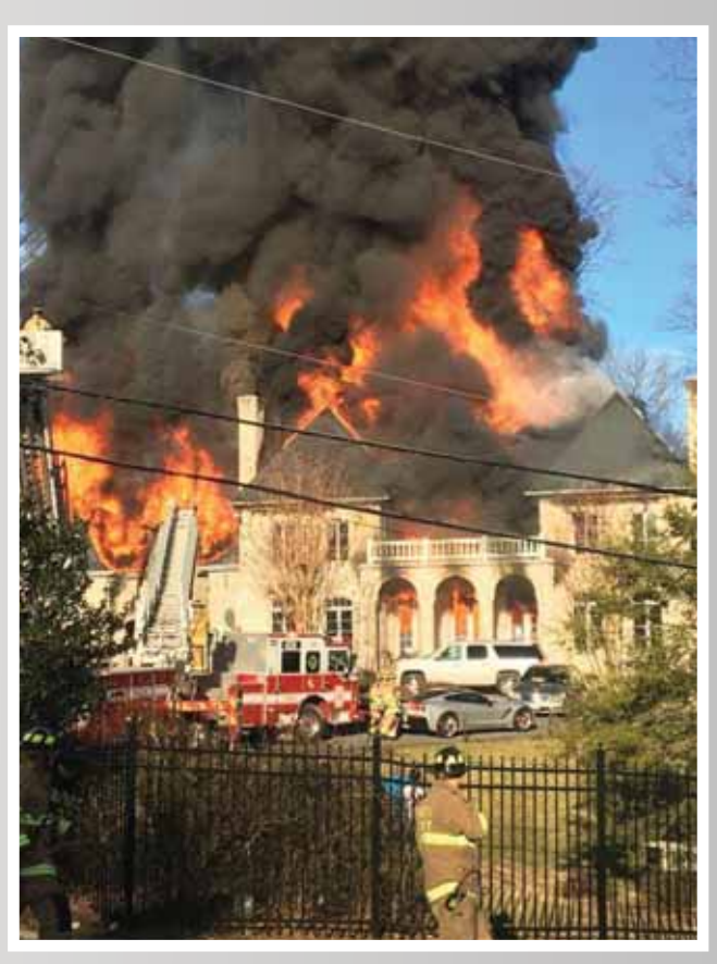
Turkey Run House Fire, McLean February 18, 2017

Units responded to the 800 block of Turkey Run Road for a house fire. Fortunately, the home had working smoke alarms and everyone escaped unharmed. Damages were estimated to be $2,175,988.