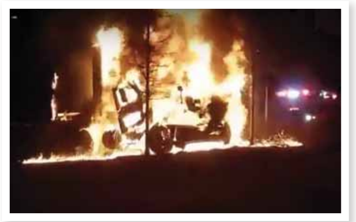
Tractor Trailer Fire: February 23, 2017

Units responded to a three-alarm garden style apartment fire. A total of 90 firefighters from Fairfax County and the City of Alexandria responded to the scene, to fight the blaze. Property damage was estimated at $167,500.