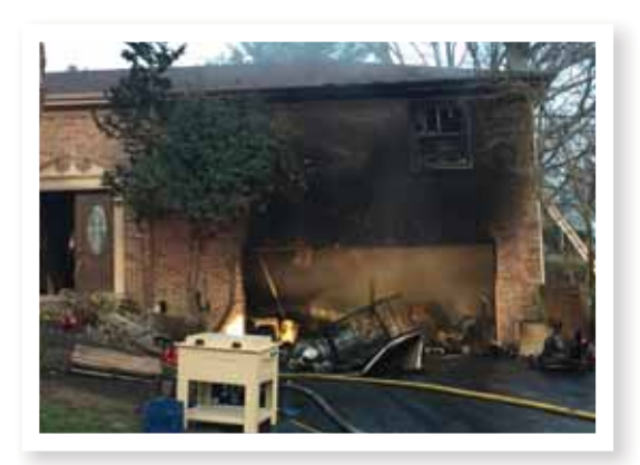
Lorton House Fire: February 21, 2017

Units responded to a reported outside fire on the rear deck of this townhome that had spread to the attic and roof. The cause of the fire was determined to be a propane cooker too close to combustible materials. Property damage was estimated at $91,000.