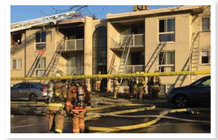
Lincolnia Apartment Fire: February 17, 2017

Units responded to a three-alarm garden style apartment fire. A total of 90 firefighters from Fairfax County and the City of Alexandria responded to the scene, to fight the blaze. Property damage was estimated at $167,500.