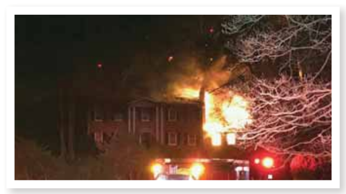
Vienna House Fire: March 22, 2017

On March 22, units responded to the 9800 block Bridleridge Court in Vienna for reports of a house fire. First arriving units found fire showing. Two patients transported to area burn center.