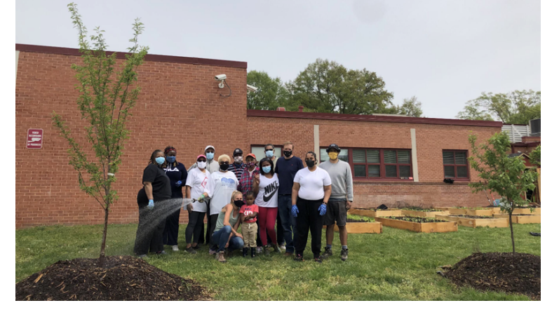
Gum Springs work group poses with newly planted plum trees

Gum Springs Community Center is located in the heart of the oldest African American community (founded in 1833) in Fairfax County. For many years residents and staff had expressed interest in having a garden, and this year the Arcadia Center for Sustainable Agriculture, the Urban Ag Work Group, Virginia Cooperative Extension and Suters Glen Permaculture farm donated staff expertise, labor, fruit trees, and lumber to build eleven raised beds, and four hugelkultur beds where two plums, two elderberries and two fig trees were planted.