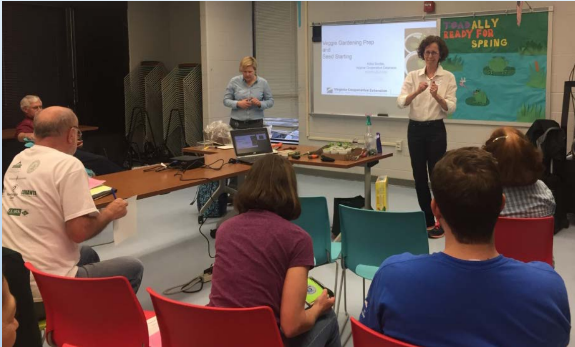
Mott Community Center -- March 31. 2017