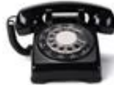
Conventional School Model

A community school is both a place and a set of partnerships among the school, county, and community resources. Its integrated focus on academics, health and social services, youth and community development, and community engagement leads to improved student learning, stronger families, and healthier communities. Schools become centers of the community with services and activities available during and beyond the school day.