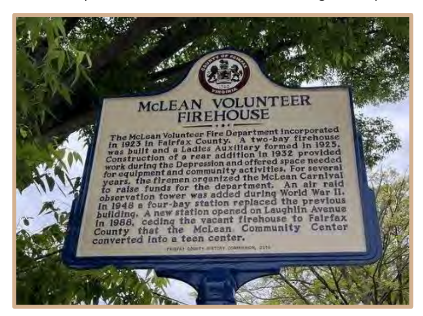
McLean Firehouse Marker

A marker dedication ceremony for the McLean Volunteer Firehouse marker was held on August 21, 2022. The ceremony had been delayed due to the Pandemic. In 2022, the Frying Pan Meeting House marker, erected in 1994, was sent to the foundry for repainting. The marker committee has been working with several applicants for new History Commission markers. Due to a backlog of orders, FCHC orders for new and replacement markers were delayed until January 2023. The cost of markers increased significantly in 2022.