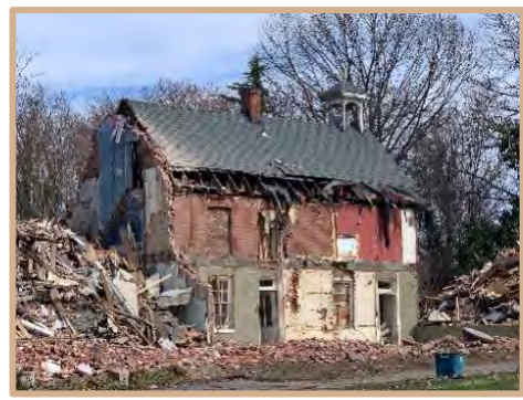
Mount Erin, March 2022