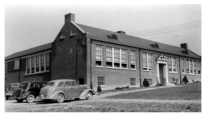
Historic Dun Loring Elementary School

Dunn Loring School: In late 2022, the History Commission learned in a public meeting that the historic Dunn