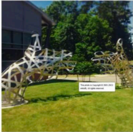
"Mutual Understanding/Mutual Respect (Installation)" 2016. Hand bent Wire Rod Materials: Steel, LED's. Ruston, Virginia. 99 x 22ft x 10ft. Photo Courtesy of PWR. https://www.pwr.com/artist/mutual-understanding-mutual-respect

The proposed location for the public art installation would be just before the entrance to the Workhouse on the Northbound traffic side of Rt 123 approximately 1,000 ft before the stoplight at Rt. 123/Workhouse Rd. The area currently has a collection of murals on the grassy hill, as indicated in the subsequent photos provided (see next page).