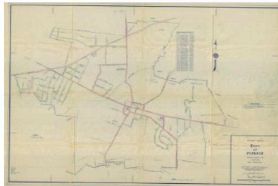
1952 Town of Fairfax boundary survey.

Late Night in the Virginia Room will return on Friday September 26 th from 5:30-11 p.m. Join fellow researchers and genealogists for after-hours research in the Virginia Room. Staff will be on hand to connect you with resources. Research independently or attend a class on how artificial intelligence (AI) can assist with genealogical research. Researchers will enjoy complimentary pizza and drinks. Attendees MUST register and arrive before the library closes at 6 pm, but may leave at any time: https://librarycalendar.fairfaxcounty.gov/event/15092400