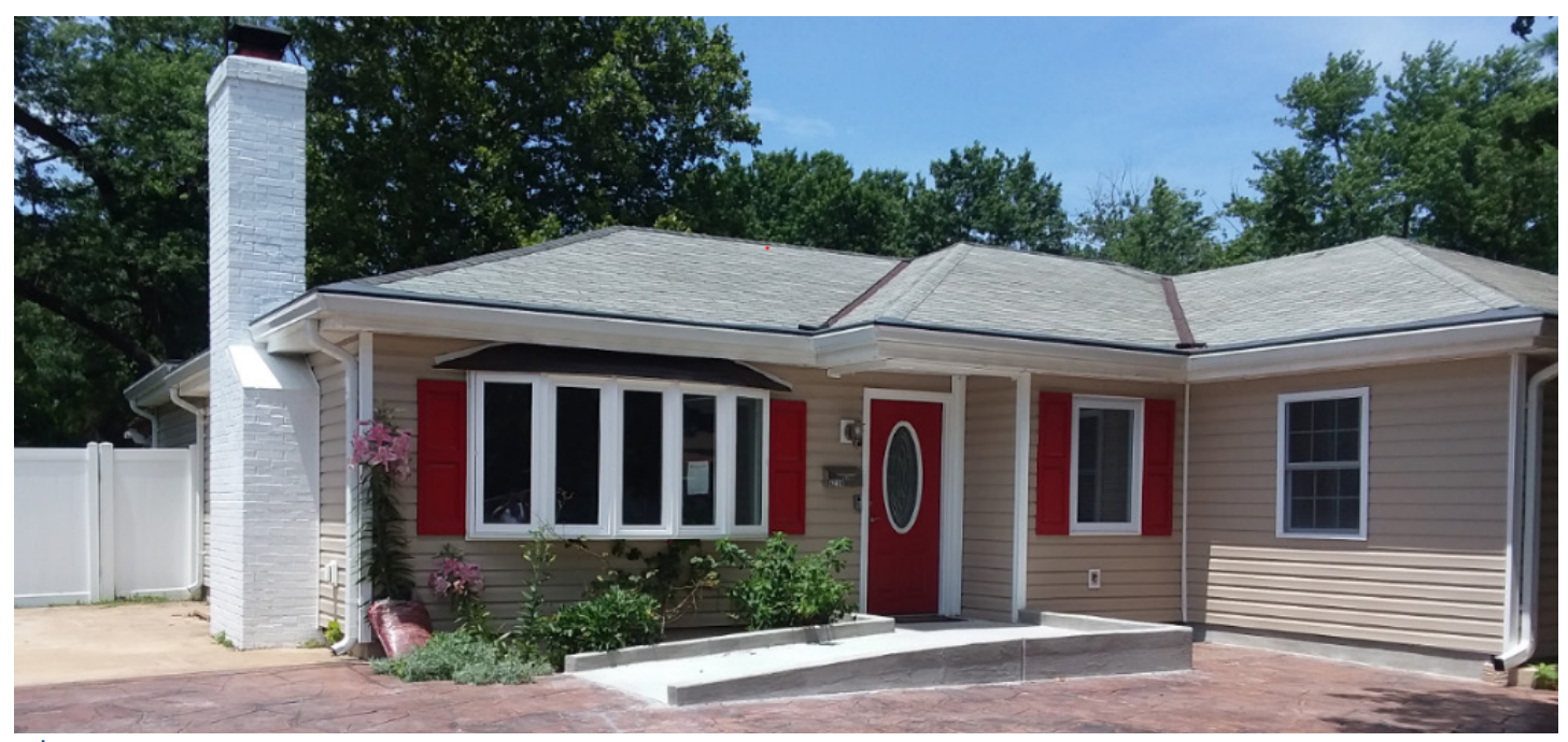
FAIRFAX COUNTY REDEVELOPMENT AND HOUSING AUTHORITY FY 2019 ANNUAL REPORT