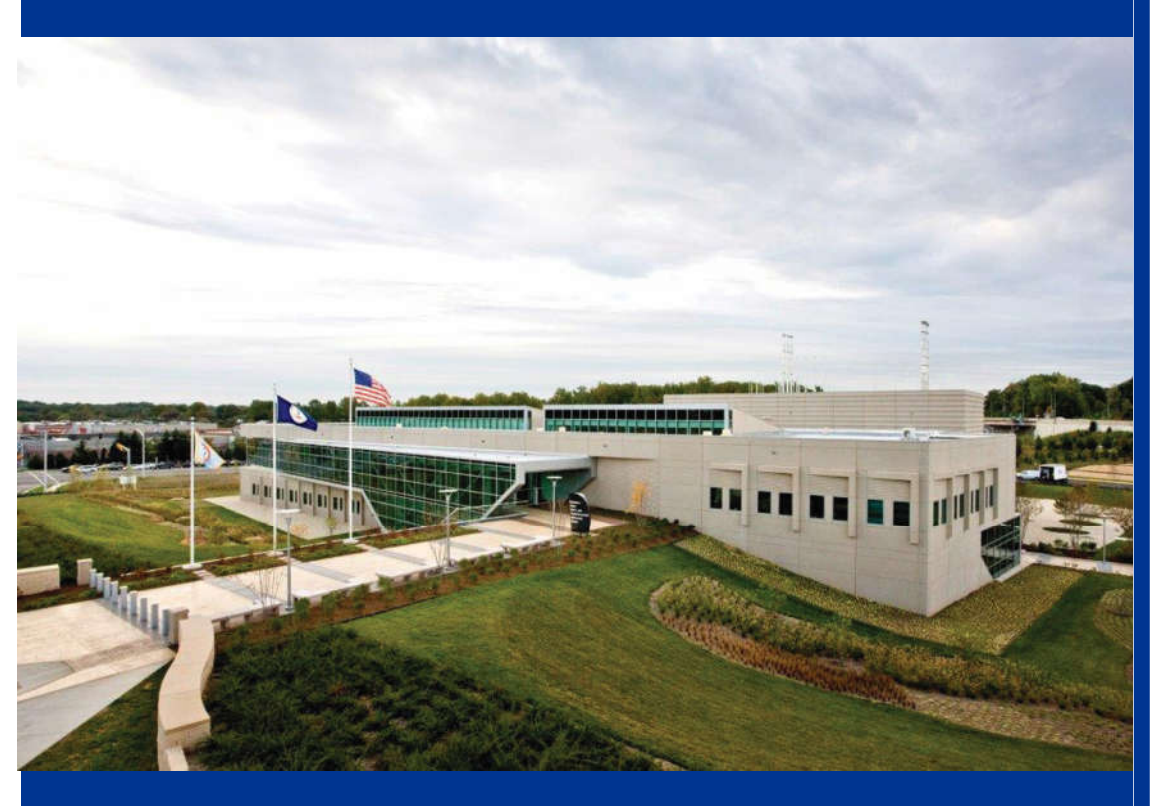
McConnell Public Safety and Transportation and Operations Center