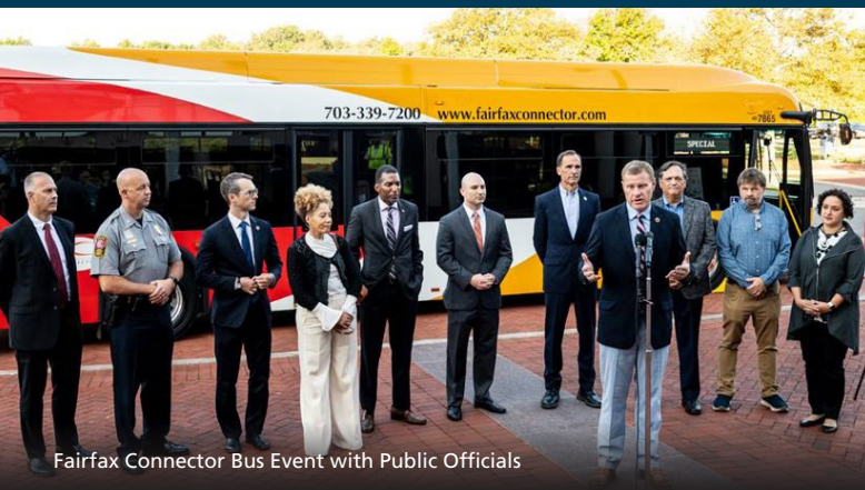
Fairfax Connector Bus Event with Public Officials

The Director serves on the Deputy County Executive's Leadership Team and represents FCDOT at meetings with the Board of Supervisors, the County Executive, the Northern Virginia Transportation Authority (NVTA), the Metropolitan Washington Council of Governments (MWCOCG), WMATA, and others.