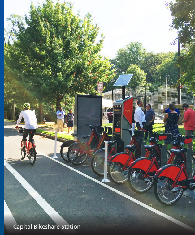
Capital Bikeshare Station

(Click on the aforementioned link to learn how Fairfax County interprets equivalencies for "Any combination, experience, and training equivalent to") Graduation from an accredited four-year college or university with a degree in civil engineering/transportation, financial management or a closely related field; plus six years of progressively responsible relevant experience including four years in a responsible administrative capacity; graduate degree in civil engineering/transportation preferred.