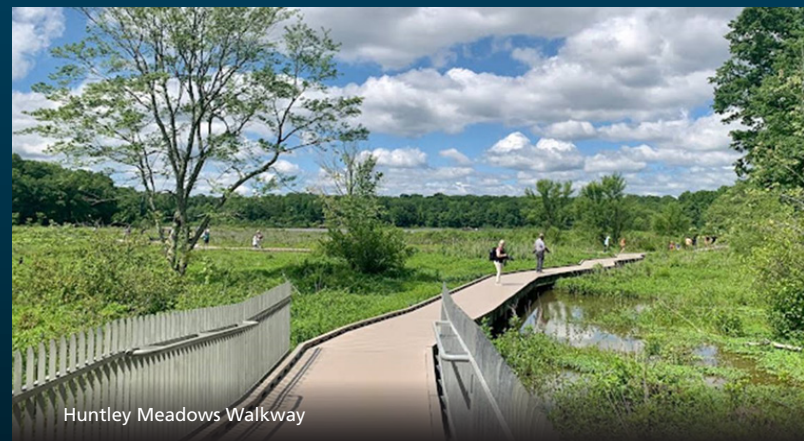
Huntley Meadows Walkway