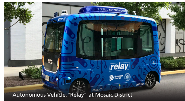
Autonomous Vehicle, "Relay" at Mosaic District