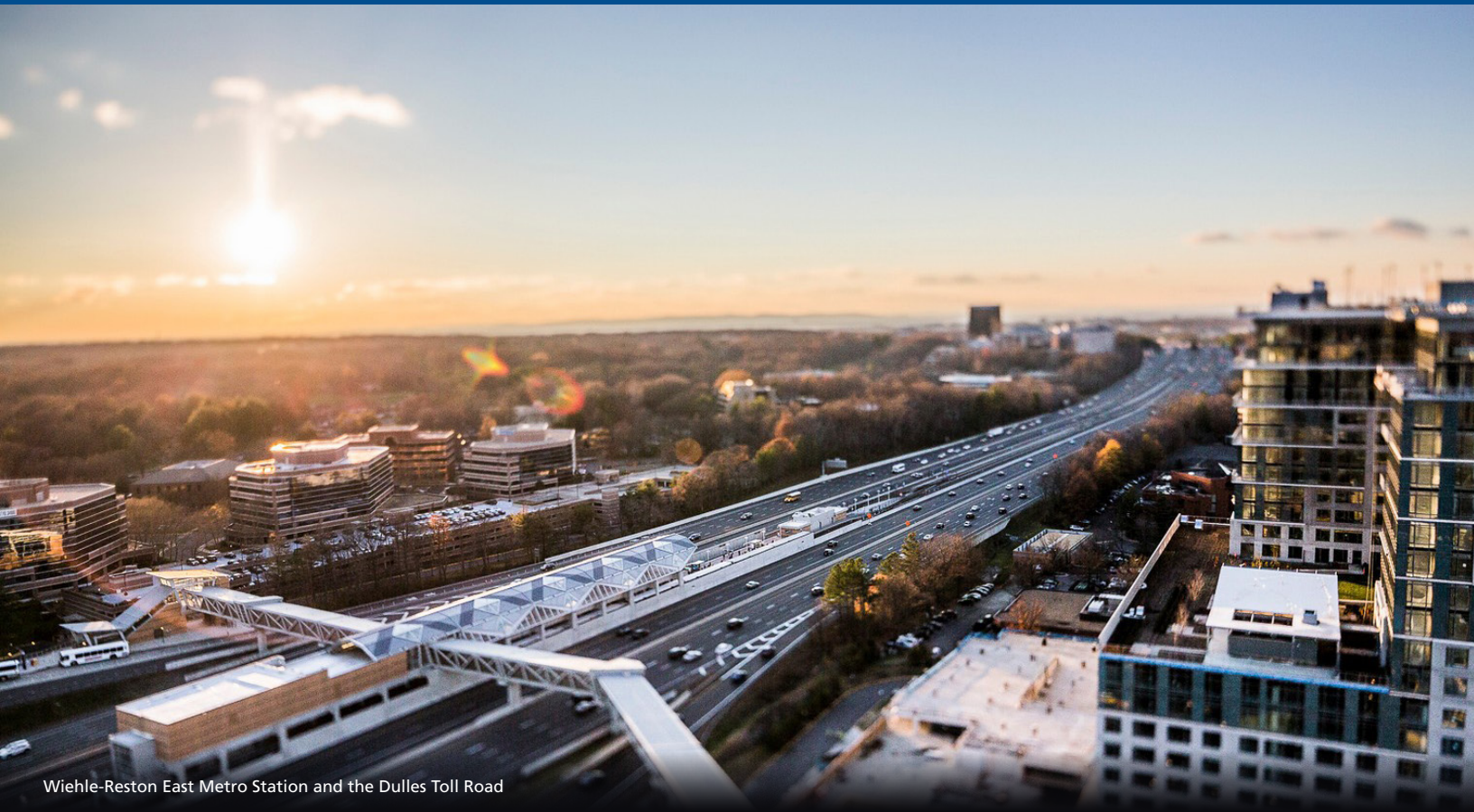
Wiehle-Reston East Metro Station and the Dulles Toll Road

Fairfax County Government Shaping the Future of Government