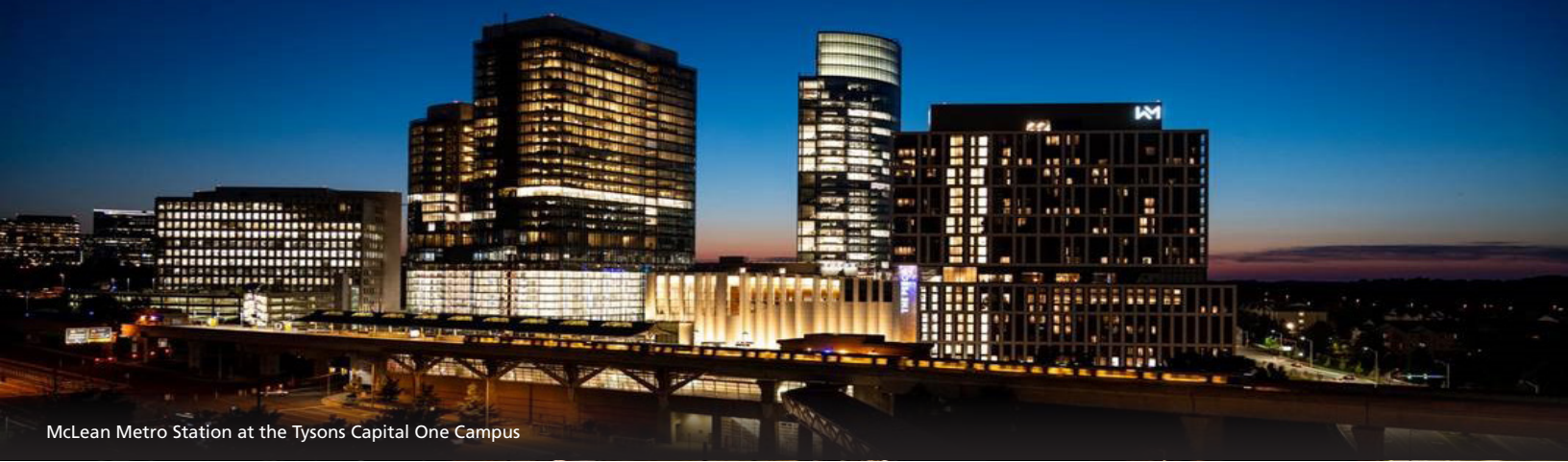
McLean Metro Station at the Tysons Capital One Campus