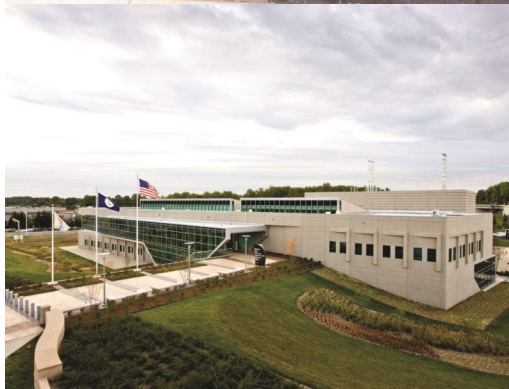
McConnell Public Safety and Transportation and Operations Center