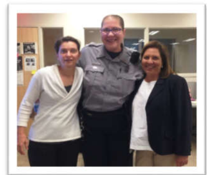
Diversion First partners.