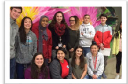
Youth Council participants.