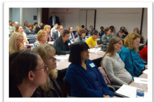
Welcoming Inclusion Network meeting.

The Fairfax-Falls Church Community Services Board (CSB) was established in 1969 by the joint action of Fairfax County, the City of Fairfax, and the City of Falls Church. This action was taken in accordance with the State Code, which requires every jurisdiction in the Commonwealth of Virginia to establish a CSB or join with neighboring jurisdictions. The CSB serves an area of nearly 410 square miles, with a population of over 1.1 million, and is the largest of the 40 Community Services Boards in the Commonwealth. In FY 2017, the CSB served approximately 23,000 individuals. Fairfax-Falls Church CSB operates as part of