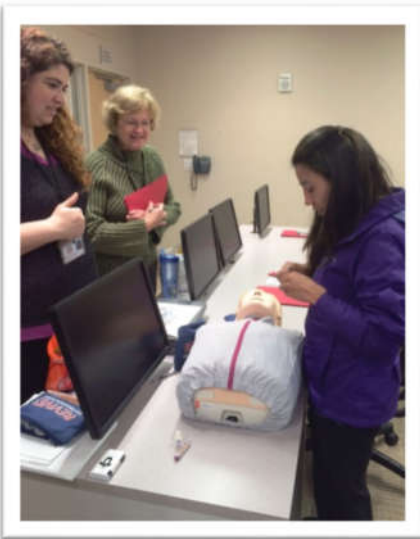
REVIVE overdose reversal training.

Must have extensive knowledge and experience in the fields of behavioral health and intellectual/developmental disabilities, community-based treatment and services, evidenced-based practice and principles of person-centered and recovery best practices. The individual must have thorough knowledge of the principles and practices of public administration, personnel management, and program evaluation and analyses. The CSB is seeking someone who can effectively lead, motivate and supervise others, understand and monitor budgets within allocated resources and project or forecast financial needs of program initiatives and expansions. It will be vital for the person to elicit collaboration and cooperation among disparate groups and individuals of varying philosophies. The person must be skilled at establishing and maintaining effective working