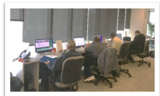
Peer Resource Center at Merrifield.

Although many services are offered directly in the community, the Fairfax-Falls Church CSB manages and operates many residential and treatment facilities throughout the county. Of special note is the 2015 opening of a new 120,000 square foot behavioral health center. With other county Health and Human Service agency partners, the Merrifield Center offers a full array of primary and behavioral health services in a collocated and integrated service facility.