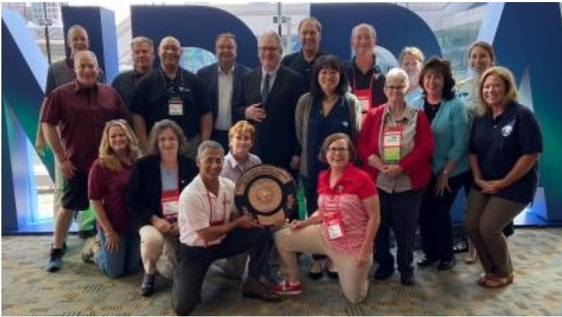
Photo: Park Authority staff pose with their Gold Medal Award at NRPA Conference

Explore the night skies this fall from the beauty of Lake Fairfax Park. Come to the "My Sky Tonight Campfire" on Saturday, October 26, 2019 . Do some stargazing and learn about the constellations and other night sky features while you enjoy a campfire and s'mores. Each family will receive a guide to the season's night sky, too. The program is designed for participants age four to adult. It runs from 7 to 8 p.m., and the cost is $7 per person. Children must be accompanied by an adult who is also registered in the program. This program is not appropriate for children younger than age four.