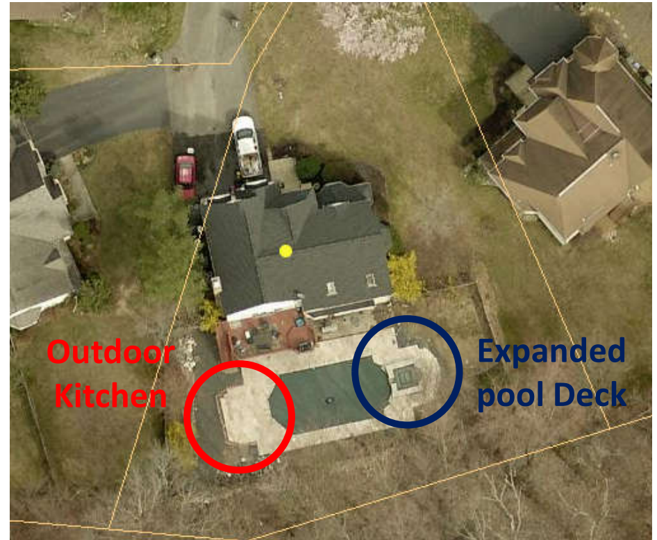
(Latest) 2019 County GIS Imagery