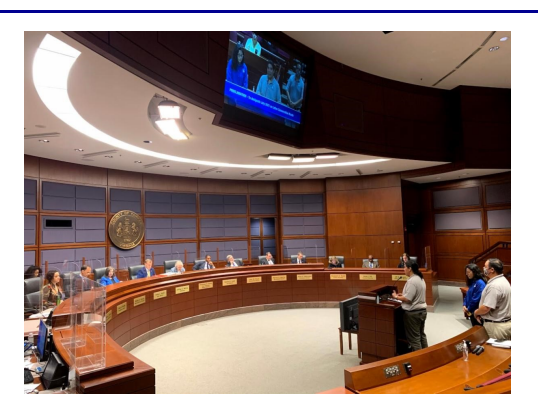
July 2021 as Latinx Conservation Month

To view the June 22, 2021 Board Package click here.