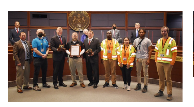
May as Lyme Disease Awareness Month