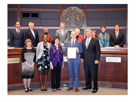
October 2019 as Financial Planning Month