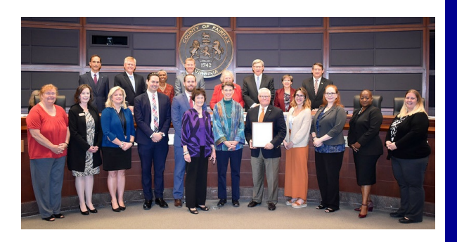
October 26, 2019 as VolunteerFest Day

To view the October 15, 2019 Board Package click here.