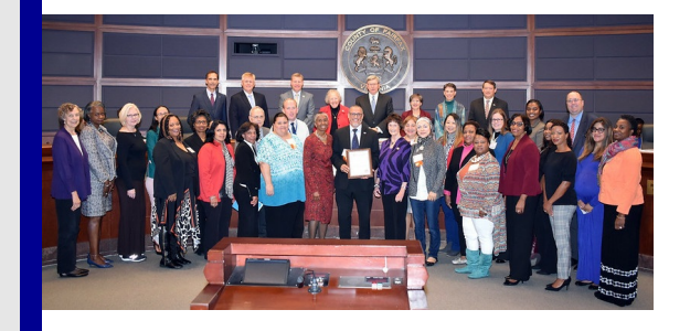
October 2019 as Head Start Month