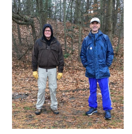
First Hike 2021!