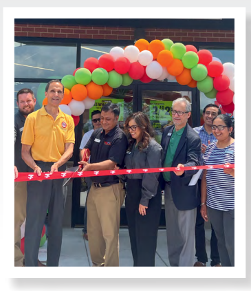
7-11 Lukens Lane Grand Opening