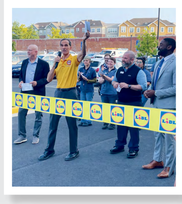
Lidl Lorton Grand Opening