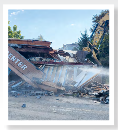
Cleaning Up the Highway