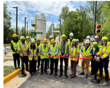
Accotink Odor Control Ribbon Cutting at Noman Cole Water Recycling Facility