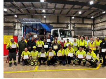
Vacuum Leaf Collection Awards