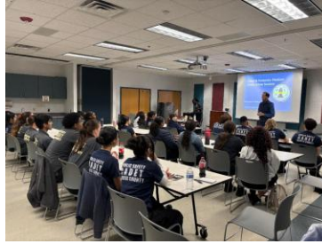
Public Safety Cadets Meeting