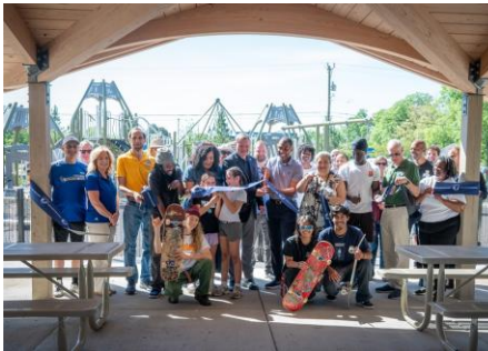
MV Woods Park Ribbon Cutting