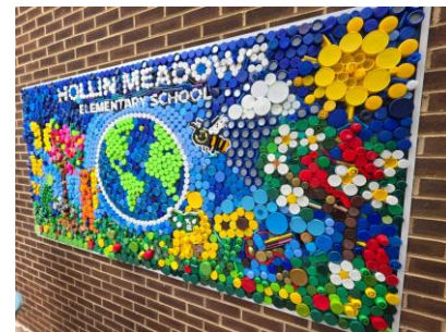
Bottle Cap Mural at Hollin Meadows

Upcoming Events Celebrating Our Community Land Use & Economic Development Transportation Health, Housing & Human Services Public Safety Parks & Environment In the News Pet Adoption Corner Connect With Team MVD Boards, Authorities & Commissions