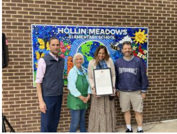
Hollin Meadows Bottle Cap Mural and 60th Anniversary Event