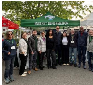
MV Farmers Market is NOW OPEN every Wednesday, 8 a.m. - noon!