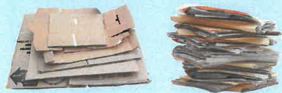
MIXED PAPER AND CARDBOARD

*For specialty items such as food containers like tubs, clamshells and other plastics, please contact your hauler.