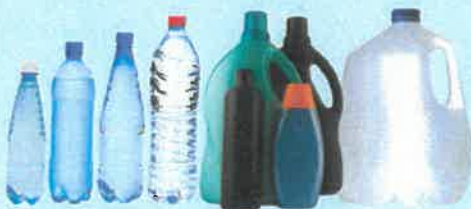
PLASTIC BOTTLES AND JUGS (LIDS ON)