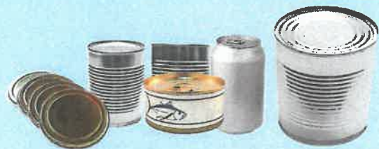
METAL FOOD AND BEVERAGE CANS