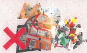
FOOD BAGS AND WRAPPERS