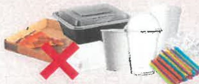
FOAM AND PLASTIC TAKEOUT CUPS AND CONTAINERS