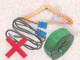
HANGERS, HOSES AND CABLES