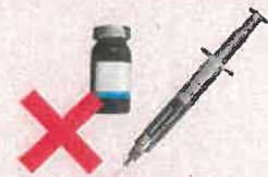
NEEDLES AND MEDICAL WASTE