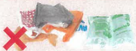
PLASTIC BAGS, FILM AND PILLOW PACKAGING