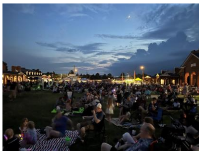
FireWorks 2025 at the Workhouse Arts Center