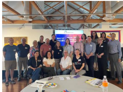
MVD Arts Roundtable