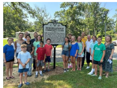
Little Hunting Park Historical Marker Dedication