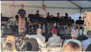
Opening Night at the Workhouse Arts Center for the Mount Vernon Nights Summer Concert Series