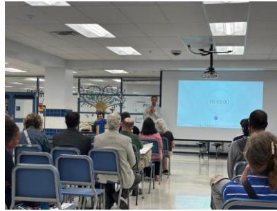
I-495 Southside Express Lanes Study Public Hearing