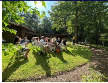
60th Anniversary of Pope-Leighey House