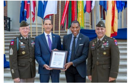
Celebrating the 250th Birthday of the U.S. Army at Fort Belvoir