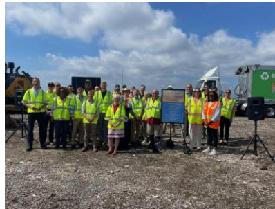
I-95 Landfill 5-Megawatt Solar Array Groundbreaking