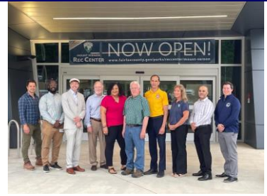
Ribbon Cutting of the Mount Vernon Rec Center