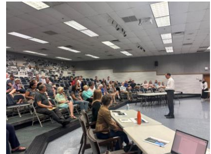
Mount Vernon Master Plan Community Visioning Meeting Click here to view the presentation