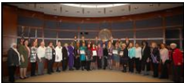
April 2 - 8, 2018 as Public Health Week