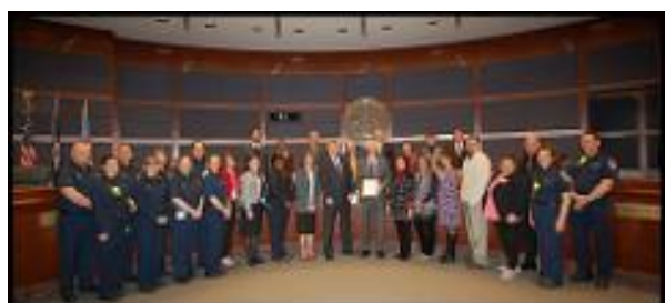
April 2 - 6, 2018 as Community Development Week