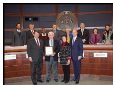
April 8 - 14, 2018 as Library Week