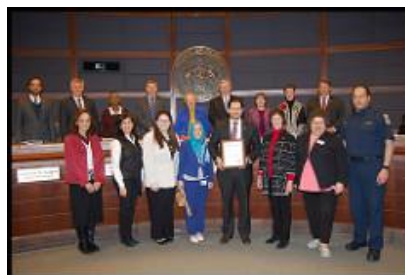
April 2018 as Fair Housing Month