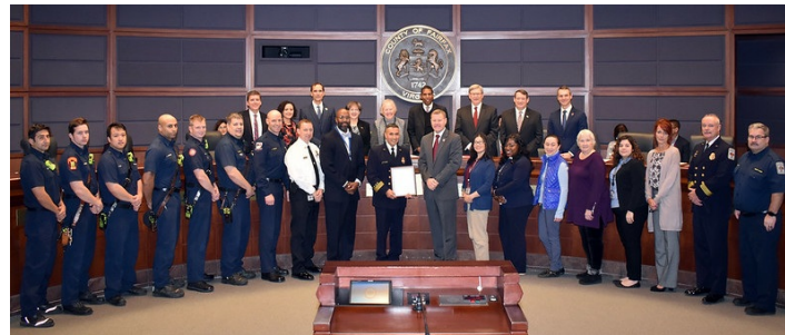
January 20 - 26, 2020, as Community Risk Reduction Week

To view the January 14, 2020 Board Package click here .