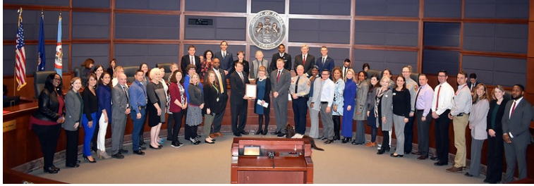
January 2020 as Human Trafficking Awareness Month