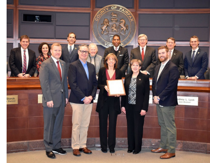
January 19 - 25, 2020, as Teen Cancer Awareness Week