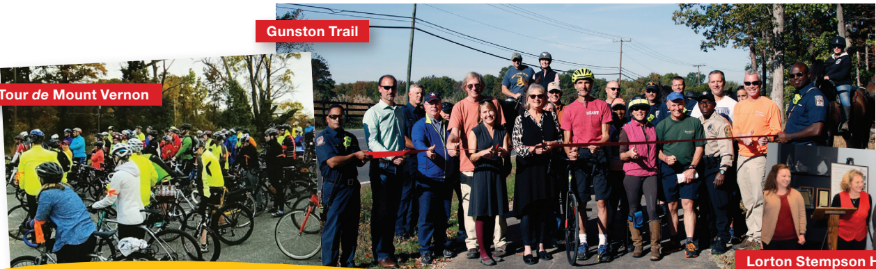
Lorton Stempson House