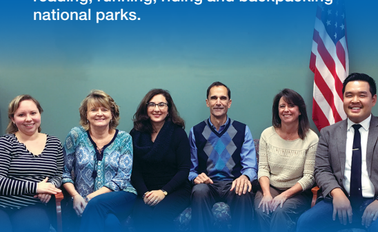
TEAM MVD (LEFT TO RIGHT)

Joys: Family, friends, community, reading, running, riding and backpacking national parks.