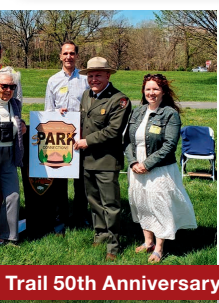
Trail 50th Anniversary