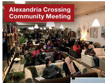
Alexandria Crossing Community Meeting