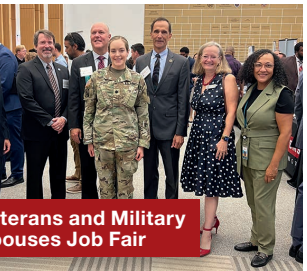
Veterans and Military Spouses Job Fair