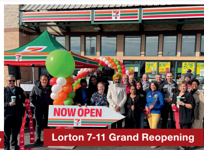
Lorton 7-11 Grand Reopening