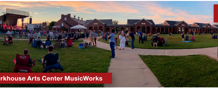
Workhouse Arts Center MusicWorks