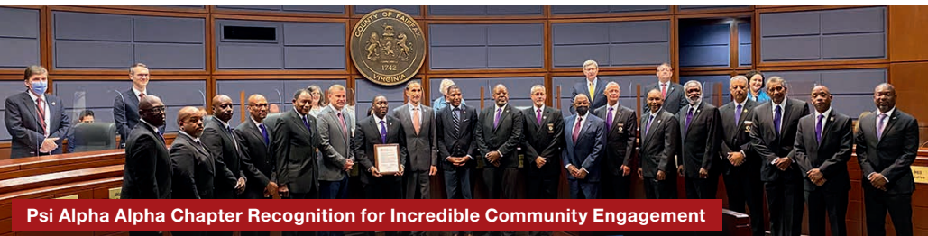
Psi Alpha Alpha Chapter Recognition for Incredible Community Engagement