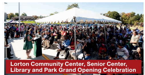
Lorton Community Center, Senior Center, Library and Park Grand Opening Celebration