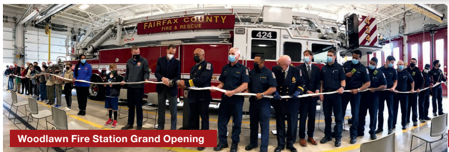
Woodlawn Fire Station Grand Opening