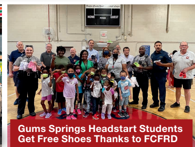
Gums Springs Headstart Students Get Free Shoes Thanks to FCFRD