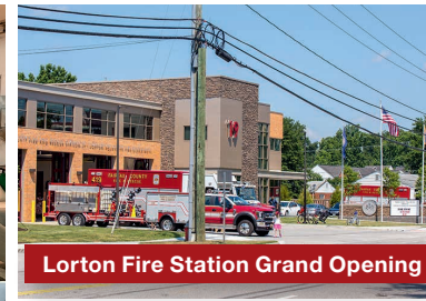
Lorton Fire Station Grand Opening