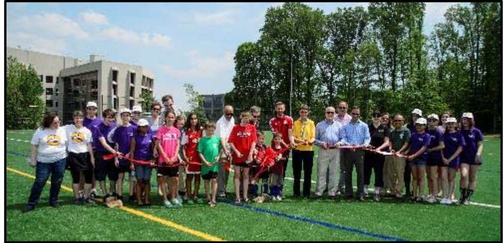
Jones Branch Fields