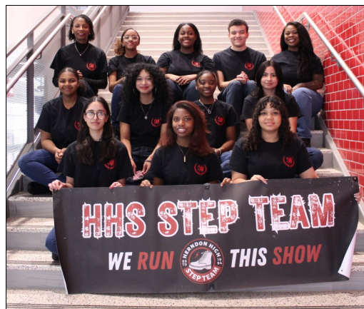
Herndon High School Step Team