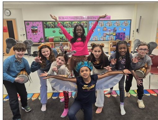
Hollin Meadows Elementary School Majorettes