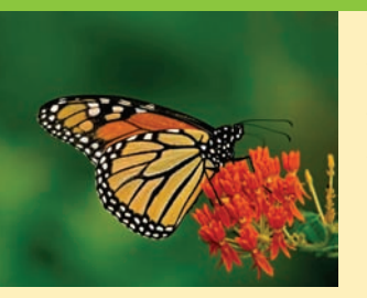
One benefit of native plants: wildlife.

The regular happy-go-lucky plant that will make your backyard bloom with health and vigor is most likely one of about 4,000 native plant species found throughout Virginia. Native plants in any particular area are those which arrived, established and survived without any human