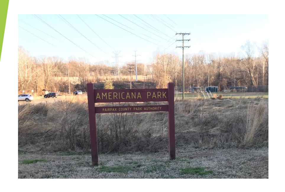
PROJECT: Backstop Replacement Americana Park