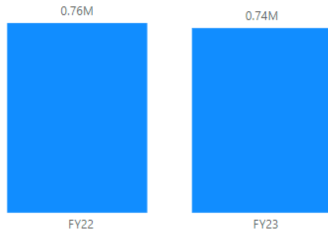
Hours Worked- PPI4-PP23