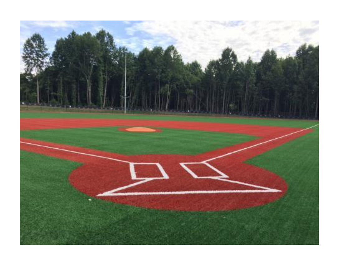
PROJECT: Diamond Field Conversion - Linway Terrace Park