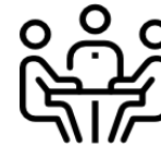
Hyper-Local Bond Info Sessions