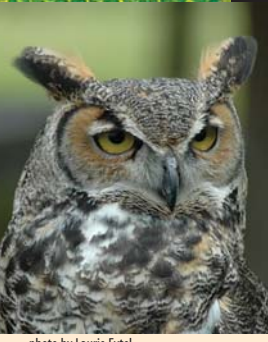
nighttime is an important time for wildlife. They use the cover of night to avoid predators and cues from the stars to navigate on long journeys. Imagine the thousands of tiny twinkling lights in the dark night — lightning bugs looking for love in the forest or meadow. Not least of all, there are the small mammals using