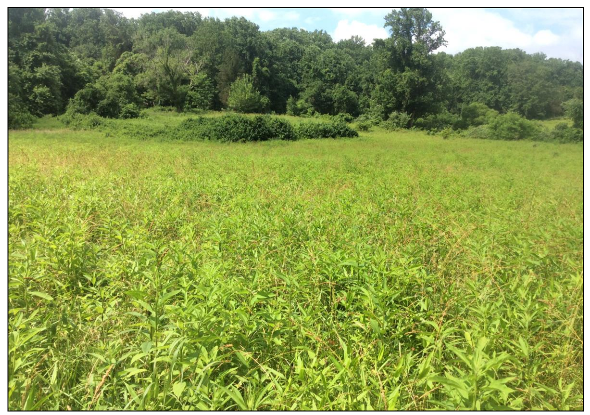
Unit RB1 prior to restoration treatments (2018). This meadow was dominated by nonnative orchard grass ( Dactylis glomerata ) and two weedy native species: deer-tongue grass ( Dichanthelium clandestinum ) and wingstem ( Verbesina alternifolia ).

Invasive species and low native plant biodiversity were the primary problems in meadow restoration units prior to project implementation. Each meadow restoration unit has a different site history and set of degrading pressures. Primary degrading pressures include an extended history of agriculture, past construction and soil grading, invasive species pressure, and white-tailed deer over abundance. Historical aerial