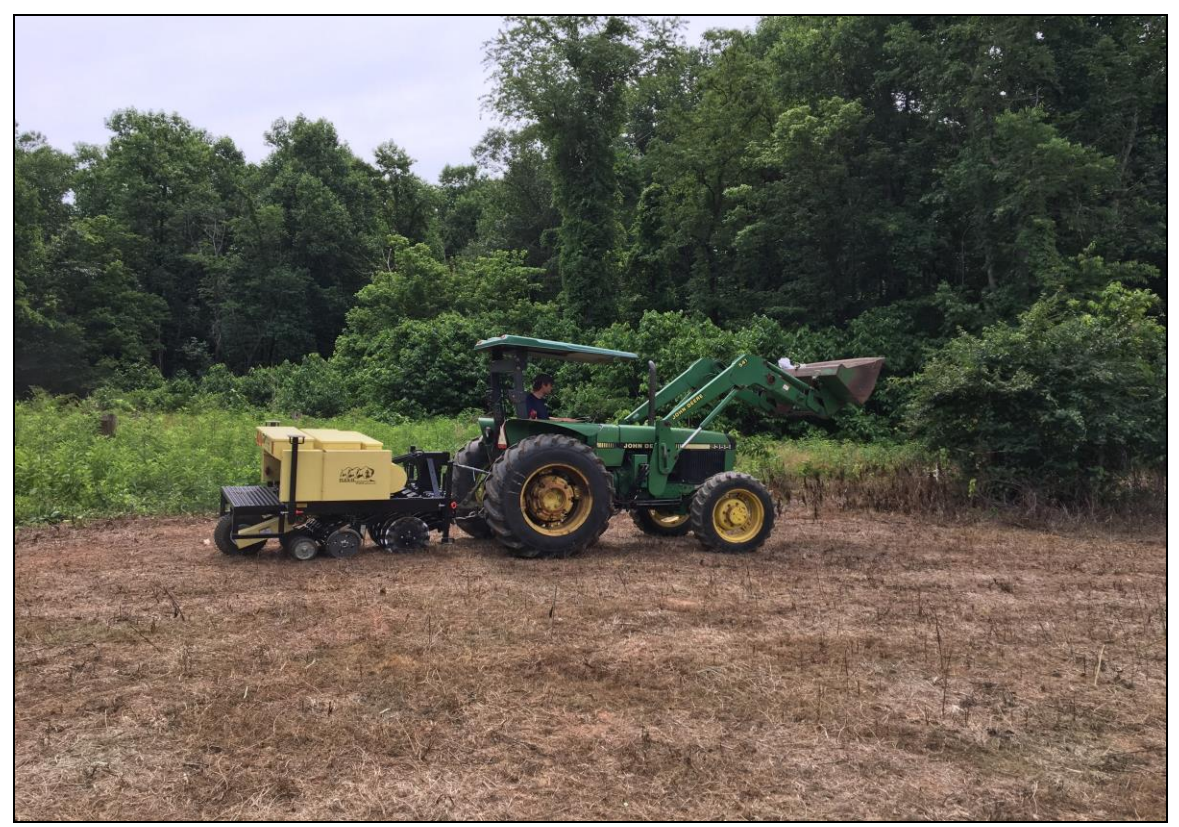
After bare-ground herbicide treatments, tractor raking, and leaf blowing, RB1 is prepared for restoration seeding (June 2019).

3. Cultipacking – This method was used for meadow restoration areas that were Harley raked and hand broadcasted. After seeding, a hand-pulled lawn roller filled with 20 gallons of water was drawn over the entire restoration unit to press the native seed into the soil. Used on RB2, RB3.