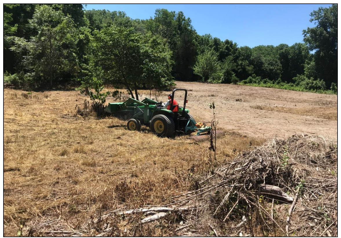
RB1 after bare-ground herbicide treatments. NRB staff used a tractor rake to prepare the site by removing thatch and exposing mineral soil. This was labor intensive and time-consuming.

2. <u>Complete vegetation removal is essential to seeding success</u>: Prior to seeding RB1, existing vegetation (mostly invasive pasture grasses) was removed by broadcast spraying a broad-spectrum herbicide. Throughout most of RB1, herbicide was broadcast twice; once in fall 2018 and once in spring 2019 prior to seeding. Due to contractor error, about ½ acre received only one herbicide application in spring 2019. The difference between the area sprayed twice and the area sprayed once was drastic; the area sprayed twice had less weedy/invasive plants and better native plant establishment, while the area sprayed only once is now dominated by weedy natives such as deer-tongue grass ( Dichanthelium clandestinum ) and patches of invasives such as mugwort ( Artemisia vulgaris ). This illustrates the importance of at least two herbicide applications prior to seeding, in order to deplete the seed bank of undesirable plants.