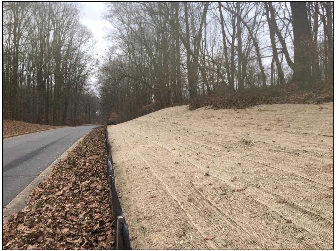
The second seeding attempt for RB3 occurred in December 2019 and incorporated wheat straw and jute matting for erosion control.

larger restoration units. Due to the proximity of RB3 to pavement, silt fence was installed and maintained throughout the project duration, further increasing project costs. This resulted in a much higher cost per acre than larger restoration units. Based on this experience, NRB staff determined that small projects with special consideration (stormwater features, erosion control, etc) would be considered low priority for future HOLH projects.