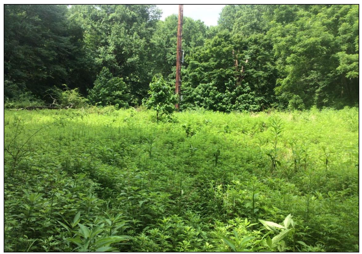
Unit RB2 was heavily invaded by mugwort ( Artemisia vulgaris ) prior to restoration treatments (2018). Mugwort is tall, rhizomatous, and allelopathic. The only native species that grew alongside mugwort was wingstem ( Verbesina alternifolia ).

photography shows that the largest restoration unit (RB1) has been in herbaceous vegetation, presumably pasture, since at least 1937. Prior to project implementation, RB1 was dominated by non-native pasture grasses (such as?). Restoration unit 2 (RB2) contained a home site from 1937 through 1976, and the surrounding land was used for agriculture until at least 1960. RB2 was more recently disturbed when a telecommunications tower was installed, and the site sees light vehicle traffic for routine tower maintenance. Prior to project implementation, RB2 was a near-monoculture of invasive mugwort ( Artemesia vulgaris ). Restoration unit 3 (RB3) is located on a roadcut bank beside what is now the main entrance to the park's visitor center. The road was constructed around 1960 and RB3 appears to have been routinely cleared/mowed until project implementation. Prior to project implementation, RB3 was dominated by invasive species such as wineberry ( Rubus phoenicolasius ) and Japanese stiltgrass ( microstegium vimineum ).