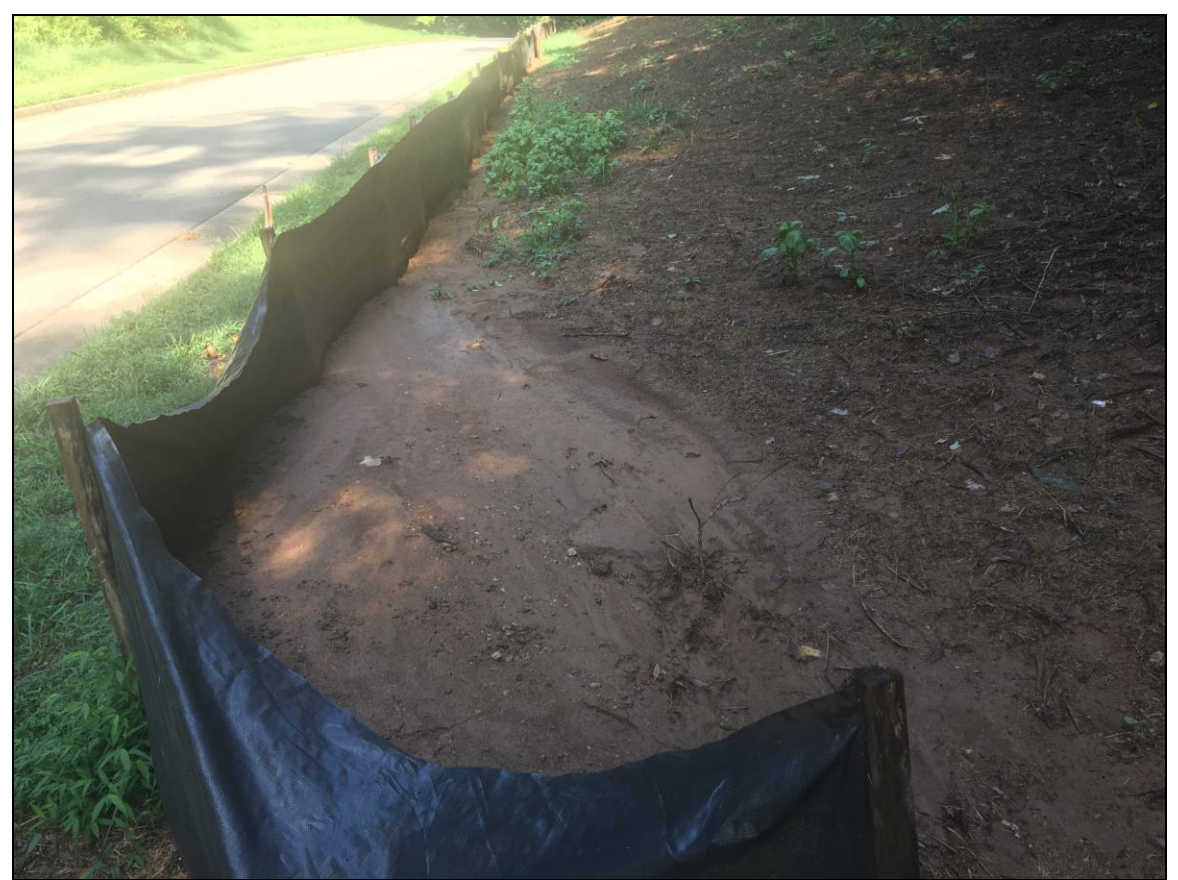
A large amount of mineral soil washed out of RB3 and accumulated behind the silt fence during a 200-year rainstorm shortly after the first seeding attempt in June 2019. The storm may have contributed to the failure of the first seeding attempt.

7. <u>Steep grassland restoration sites require erosion control measures</u>: RB1 and RB3 were seeded in June 2019, immediately preceding a 200-year rain event. Neither unit received any erosion control measures. The terrain in RB1 is mostly flat or gently rolling, although there are several steep slopes through the unit. RB3 is a relatively steep roadcut, although the slope extends upward only about 30 feet and does not receive stormwater from upstream. The 200-year rain event washed out and prevented germination in the steep sections of RB1 and the entirety of RB3. As a result, RB3 needed to be completely reseeded and RB1 received supplemental seeding in bare areas. Erosion control measures, such as straw and jute matting, were added to prevent further erosion.