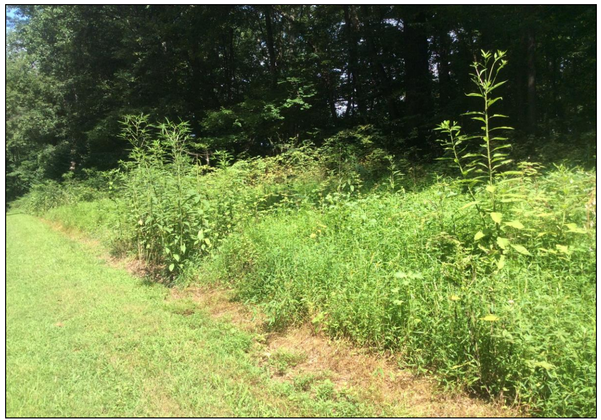
Prior to restoration treatments RB3 was occupied mostly by invasive species including Japanese stiltgrass ( Microstegium vimineum ) and wineberry ( Rubus phoenicolasius ) (2018).