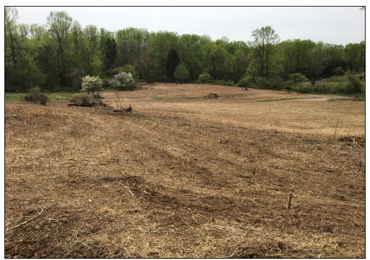
After bare-ground herbicide treatments, tractor raking, and leaf blowing, RB1 is prepared for restoration seeding (April 2019).