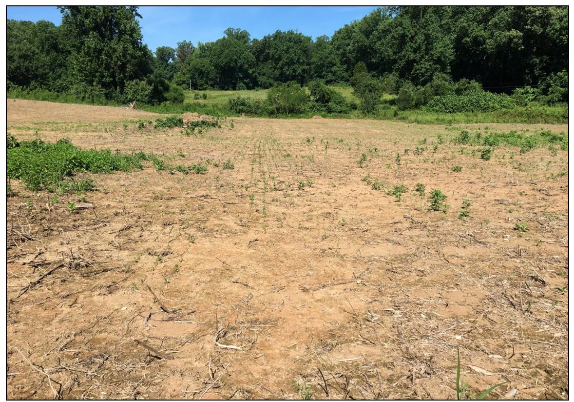
Native grass and forbs germinating in seed drill furrows about a month after seeding. Some patches of soil were washed out from a 200-year rainstorm that occurred shortly after seeding, which may have negatively impacted germination.

1. <u>Seed drilling is an effective way of establishing native warm season grasses</u>: Native warm season grasses (NWSG), such as Indian grass ( Sorghastrum nutans ) and little bluestem ( Schizachyrium scoparium ), were seeded in all grassland restoration units. NWSG were seeded in June 2019 using a Truax native grass seed drill in RB1 and seeded by hand in RB3. Germination was quick and uniform in RB1 yet failed entirely in RB3. Although the site conditions differed considerably among the two restoration units, it is likely that the seed drill provided better germination conditions than hand seeding for NWSG. It is also possible that the seed drill prevented movement and loss of seed during an extreme thunderstorm event in June 2019. Germination across RB1 does not appear to have been affected but it is possible that seed was lost on slopes in RB2 and RB3 which had much lower establishment rates.