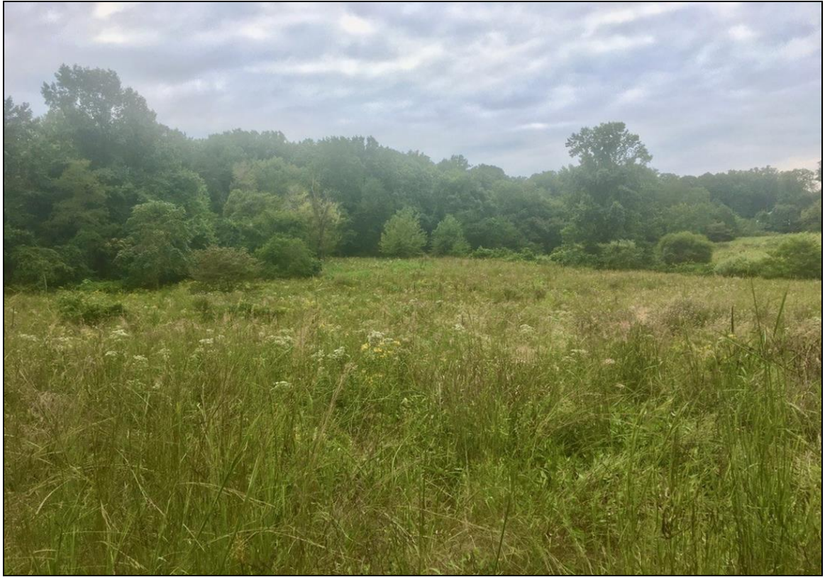
By late Summer 2020 native grasses and forbs are fully established in RB1. The growing space is occupied entirely by a diverse mix of at least twenty native grassland species. A diversity of native forbs bloomed from spring through fall, providing floral resources for pollinators throughout the growing season.