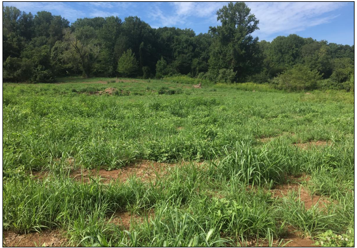
Native grasses establishing and growing vigorously about three months following seeding. Establishment of grasses was faster and denser than in previous restoration projects in other locations.

11. <u>Ecotype of native seed may be an important consideration in meadow restoration</u>: Restoration seedstock for Indiangrass ( Sorghastrum nutans ) and little bluestem ( Schizachyrium scoparium ) was purchased from two native seed vendors: one located in Kentucky and one in Pennsylvania. The HOLH program's policy is to purchase seedstock with a source population as geographically similar to Northern Virginia as possible. In this case, the Indiangrass was sourced from a Kentucky population and little bluestem from a North Carolina population.