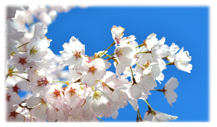
Akebono Yoshino Cherry

1-2pm. (5-Adult) Celebrate Earth and say thanks with face painting, poetry, pictures and puppets! Make a special Earth Day craft and help us decorate a tree. $10 per person (parents and children must register, in order to track registration numbers). Code <u>GIF.M37P</u>.