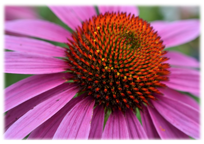
Echinacea (purple coneflower)