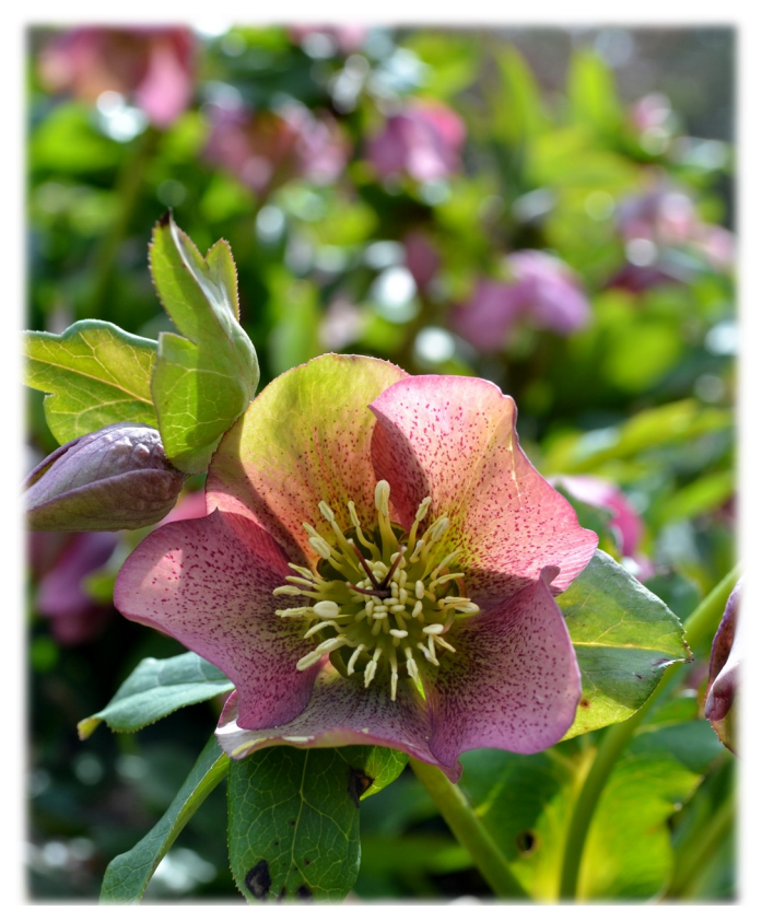
Hellebore (lentin rose)

critique, and lesson on editing. $55 per person. Code <u>806.AB4J</u>.