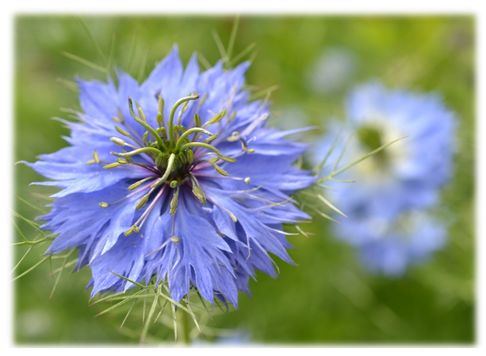
Nigella damascene (Love-in-a-Mist)

1-3pm. This program includes activities from the Journey books and introduces the topics, issues, and science behind the journey. We do not complete a take action project but instead provide the girls with the foundation they need to plan their own. $12 per scout. Code <u>920.6TF2</u>.