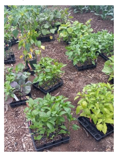
Various crops ready for transplant

Many summer crops from the poly house were taken outside to be transplanted. They included many varieties of sweet peppers, hot peppers, bell peppers, and eggplants. Tomatillos were also planted outside today.