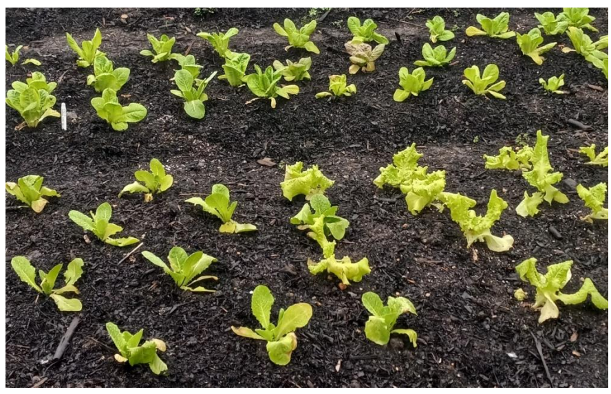
Various cabbage (left) and lettuce (lower right) varieties in the garden.

Due to increment weather today, the EMGs did not meet in the Edible Garden, however, the crops they planted last week seem to be thriving well.