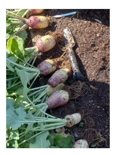
Rutabagas laid out with a trowel

The Super Sugar Snap Peas and the two varieties of carrots the EMGs planted two weeks ago (on the 5<sup>th</sup> of May) are sprouting out. The Fingerling potatoes planted in March now have thick and vibrant foliage.