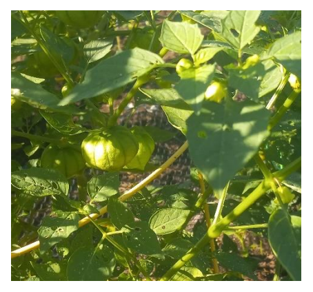
Tomatillos basking in the sunlight

A small patch of pepper plants received a fresh batch of compost today, and tomatillos that that the EMGs planted at the beginning of summer are growing nicely.