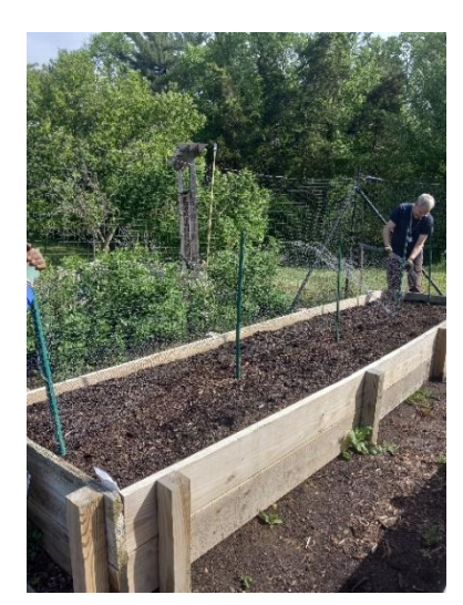
Trellis for Snap Peas

Today in the Edible Garden, the EMGs harvested the first batch of crops planted this season, which included Black Seeded Simpson Lettuce, Bok Choy, and Hakurei Salad Turnips. The harvest was weighed by type of crop and all produce was donated to a new food bank in Annandale known as The Mission Center.