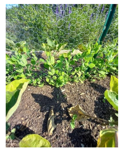
Super Sugar Snap Peas climbing the trellis

Beyond the harvest of kale and Swiss chard today, activity in the Edible Garden was mostly directed towards watering and caring for new plants. Many eggplants and peppers that were planted back on May 12 are developing their fruits. Some varieties that develop at a slower pace are still at the flowering stage. The Super Sugar Snap Peas are not flowering yet, however, they are getting taller and climbing onto the trellis the EMGs made for them.