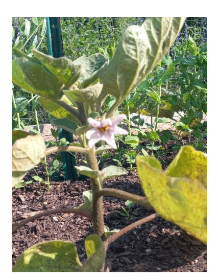
Pinkish Eggplant Flower