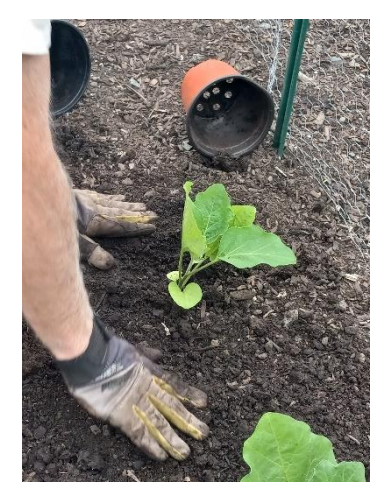
Black Beauty eggplant being planted