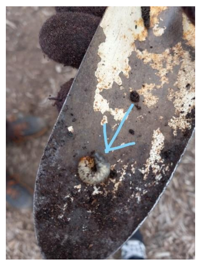
Today, when transplanting, the EMGs found another Japanese beetle grub onsite.

Did you notice that some of today's plantings are the same as last week? This is so that the harvest will not be ready all at once. During harvest season the crops will be picked in successive waves.