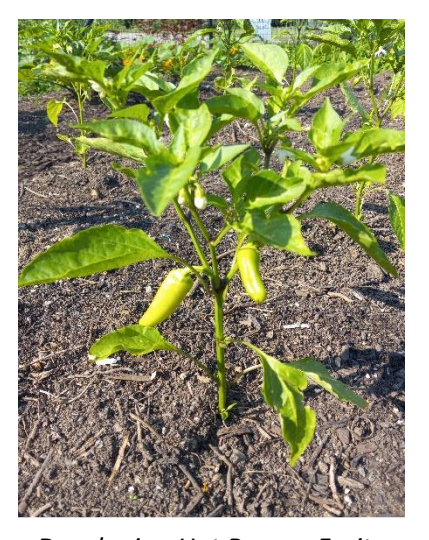
Developing Hot Pepper Fruits