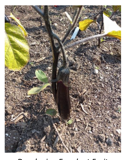
Developing Eggplant Fruit