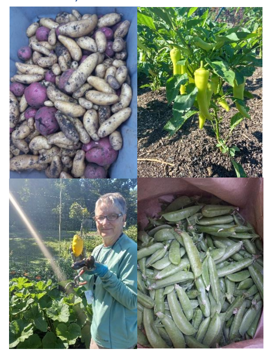
Clockwise from top left: Fingerling potatoes, peppers, Super Sugar Snap Peas, an EMG with buttercup squash and eggplant

Today was a big harvest day for the EMGs. They reaped in kale, Swiss chard, fingerling potatoes, carrots, Super Sugar Snap Peas, eggplants, and buttercup squashes. Some of the newly planted crops last week have sprouted, which prompted the EMGs to put up fences around them to prevent rabbits from having a free meal. Some of the Green Spring summer campers also came to help with harvest. The EMGs reserved a batch of peppers for them to pick.