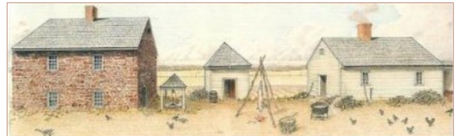
The stone dairy, well, smokehouse, laundry and kitchen.

Built circa 1794, the structure has the same flush bead siding as the main house. After meats were salted, they were suspended from crossbeams and smoked for several weeks to cure and flavor them. Barrels containing salted pork or herring may have been stored here as well. Meats were eaten by the Lees and some were distributed to the enslaved community.