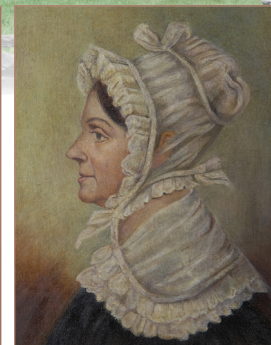
Richard Bland Lee and Elizabeth Collins Lee.